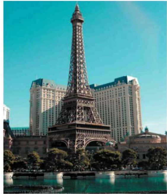
Figure 5 A simulacrum of a tower in physical space The Eiffel Tower, Las Vegas.

Part of what makes this term so catchy is that 'virtual reality' initially sounds like an oxymoron, which implies that 'virtual' is the opposite of 'reality'. Now since the word 'reality' in itself sounds very close to the adjective 'real', we find ourselves thinking of 'virtual' as the antonym of 'real'. The problem here is that it has led serious publications discussing virtual reality or its related phenomena to oppose it to what they call the 'real reality'. Then, in order to avoid the inherent vagueness and absurdity of such a term, the reference was further refined to ' "real" reality '. This implies a difference between 'real' with and without quotation marks - which in this case is another way of saying 'you know what I mean' when we do not know how to say what exactly it is, and only hope that we will be correctly understood. It proves the limitation of our current language as a common ground for a meaningful discussion.