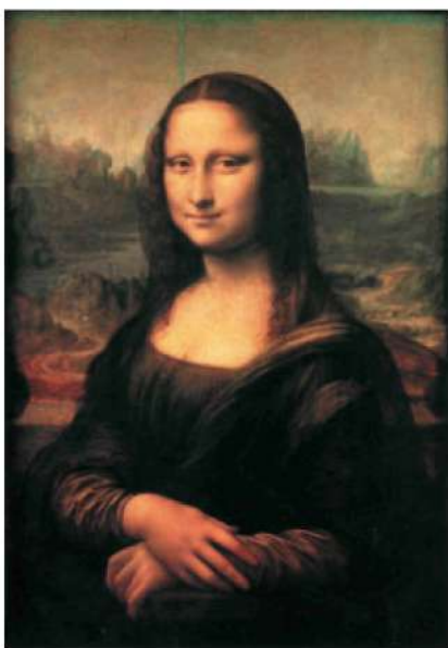
Figure 2 Leonardo da Vinci, Mona Lisa , c. 1502. Oil on wood, 77 x 53 cm.

Virtual space is a limitless and discrete space. Limitless, because it is as vast as there are 'possible visible worlds' created in our civilization. Discrete, because it is not a continuous space in which we can move freely from one place to another like we might do in physical space. The landscape behind the Tower of Babel in Breugel's painting does not connect with the landscape seen in Leonardo's painting Mona Lisa (figure 2), and whatever their relationship may be, we cannot define it in geographical terms. Each place in virtual space is accessed separately. The landscape behind the Tower of Babel is accessible via Breugel's painting, and the one behind Mona Lisa is accessible via Leonardo's painting.