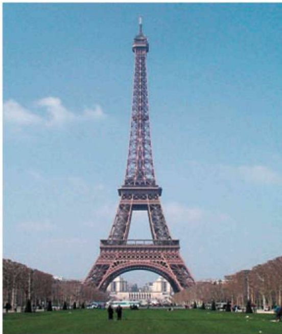
Figure 4 A real tower in physical space The Eiffel Tower, Paris.

One of the sources of confusion is the popular use of the term 'virtual reality'. This term was originally coined as the name of a technologically-advanced device for experiencing computer-generated virtual places. By using a special helmet and glove connected to a computer, it is intended to provide an experience of virtual places at a level which aims at a maximal detachment from the experience of the physical world. The catchy name of this specific product has become a widely-used reference to some general, unclear, computer-related phenomenon. The media hype around 'virtual reality' made its success as a marketing name become its failure in providing the public an understanding of what it actually is.