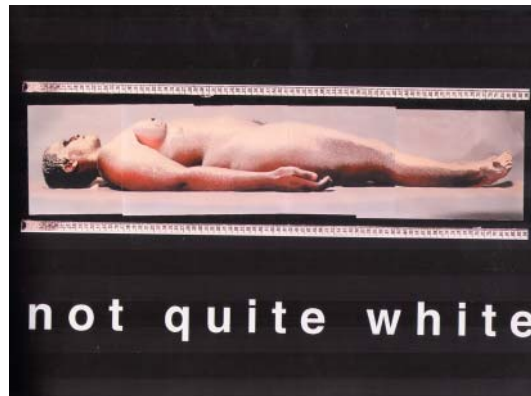
Figure 11 Berni Searle, Not quite white (2000). Billboard image, dimensions unknown.

her “that has been”, to cite Barthes (2000: 96), she also bruises, pierces, and wounds us with the knowledge of our own “that has been”.