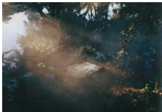
Figure 21 Shirin Neshat (1957-), Women without men (Untitled #1) (2004). C-print, 102.9 by 165.1 cm.

We are faced with the beauty of disappearance enfolded with an encounter with the sublime horror of being left alone in the oblivion of death. Searle's image thus recalls another image, strikingly conjured up in T S Eliot's The waste land (1922): that of shoring fragments against our ruins.