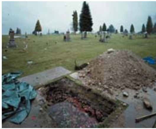
Figure 16 Jeff Wall (1946), The flooded grave (1998-2000). Transparency in lightbox, 228.5 by 282 cm. Berlin: Friedrich Christian Flick Collection

“Like a body under water focused on breathing through a straw” 37