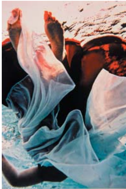
Figure 20 Berni Searle, Waiting #4 (2003). Lithograph on BFK-Rives watercolour paper, 66 by 50.5 cm.

That it proves to be the body of the artist, carried away and deterritorialised by the stream flowing between two irreconcilable places, Morocco and Spain, only furthers our sense that aesthetics fails time and again, at the moment in which it attempts to sublimate time.