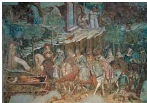
Figure 12 Francesco Traini (1321-1363), The triumph of death (c 1340). Fresco. Pisa, Camposanto.