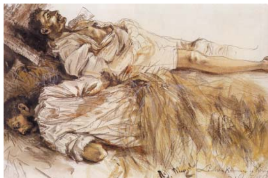
Figure 14 Adolph Menzel (1815-1905), Two dead soldiers laid out on straw (1866). Pencil and watercolour, 18 by 27 cm. Berlin: Kupferstichkabinett