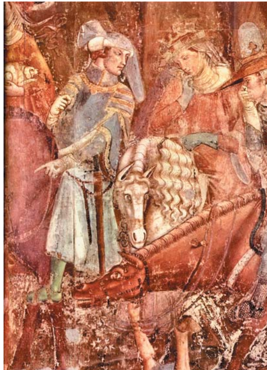
Figure 13 Francesco Traini, The triumph of death (detail).

Situated in the Campo Santo cemetery in Pisa, Traini’s mural flanks the burial ground. A flowing narrative that culminates in the three open graves at the bottom left of the picture, which reveal the thing-body in successive stages of decay, Traini’s painted reminder of death in life also includes in the narrative what is pertinently absent in pictures of death: the stench of rotting flesh. The viewer of The triumph of death beholds this stench in the faces of humans and animals alike, both of which are clearly horrified and petrified by the horrific sight and stench of human remains (Figure 13).