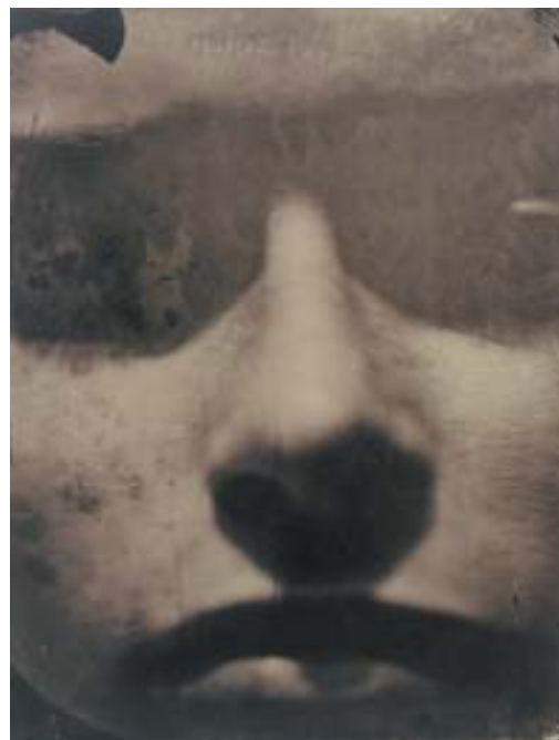
Figure 2 Sally Mann, What remains (2000). Tritone photograph, dimensions unknown.

Braided together, both the passage of time and of light relate to life and death. Bal (1999: 169) writes: “Light is not a given but a live being, a friend or an enemy, an ally or an opponent, an aid or an impediment, that lives in time”. 13 But living in time also means dying in time. Furthermore, if light is the source of life it is also the source of a photograph: it is the capturing of light that produces a photograph. Last light thus speaks not only of the last light of the living being but also of the photograph itself; both may thus be allegorised as living corpses, and as such, they also have a special relationship with art history writing as a melancholy writing about things dead as well as alive.