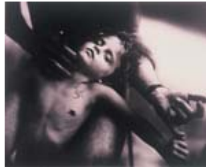
Figure 1 Sally Mann, Last light (1990). Gelatin silver print.

Two photographs by Sally Mann seem to “theorise” the curious dialectic of photographing things in order to fix and drive the passage of time out of our minds. The title of her photograph Last light (1990) (Figure 1) itself conjures up “the inexorable passage of time” (Fried 2005: 561), and light.