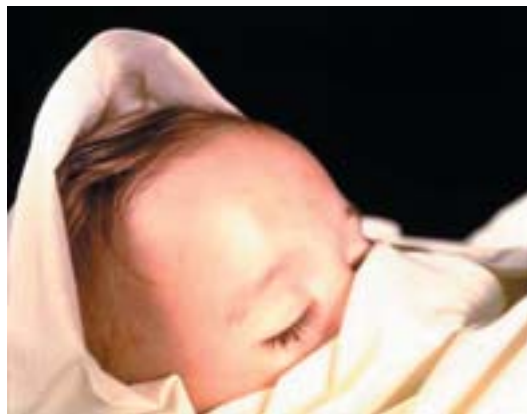
Figure 5 Andres Serrano, The morgue (Fatal meningitis II) , 1992, Cibachrome, silicone, plexiglass, wood frame, 125.7 x 152.4 cm.