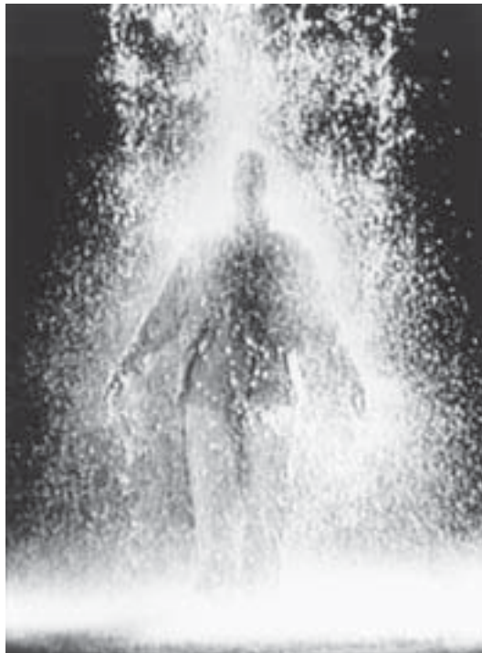
Figure 17 Bill Viola (1951-), The crossing (1996). Installation for video projection, dimensions unknown.

Recalling the enigmatically calm water that ambiguously ruins Felix in Kentridge’s Felix in exile (1994), water as the calm, distorted and distorting origin 38 is what binds Mendieta’s Untitled (Creek) (1974) 39 (Figure 18) to Searle’s lithographs Waiting (2003) (Figures 19 & 20), both recalling video images of the body disappearing in water by Bill Viola — as in, for example, The crossing (1996) (Figure 17).