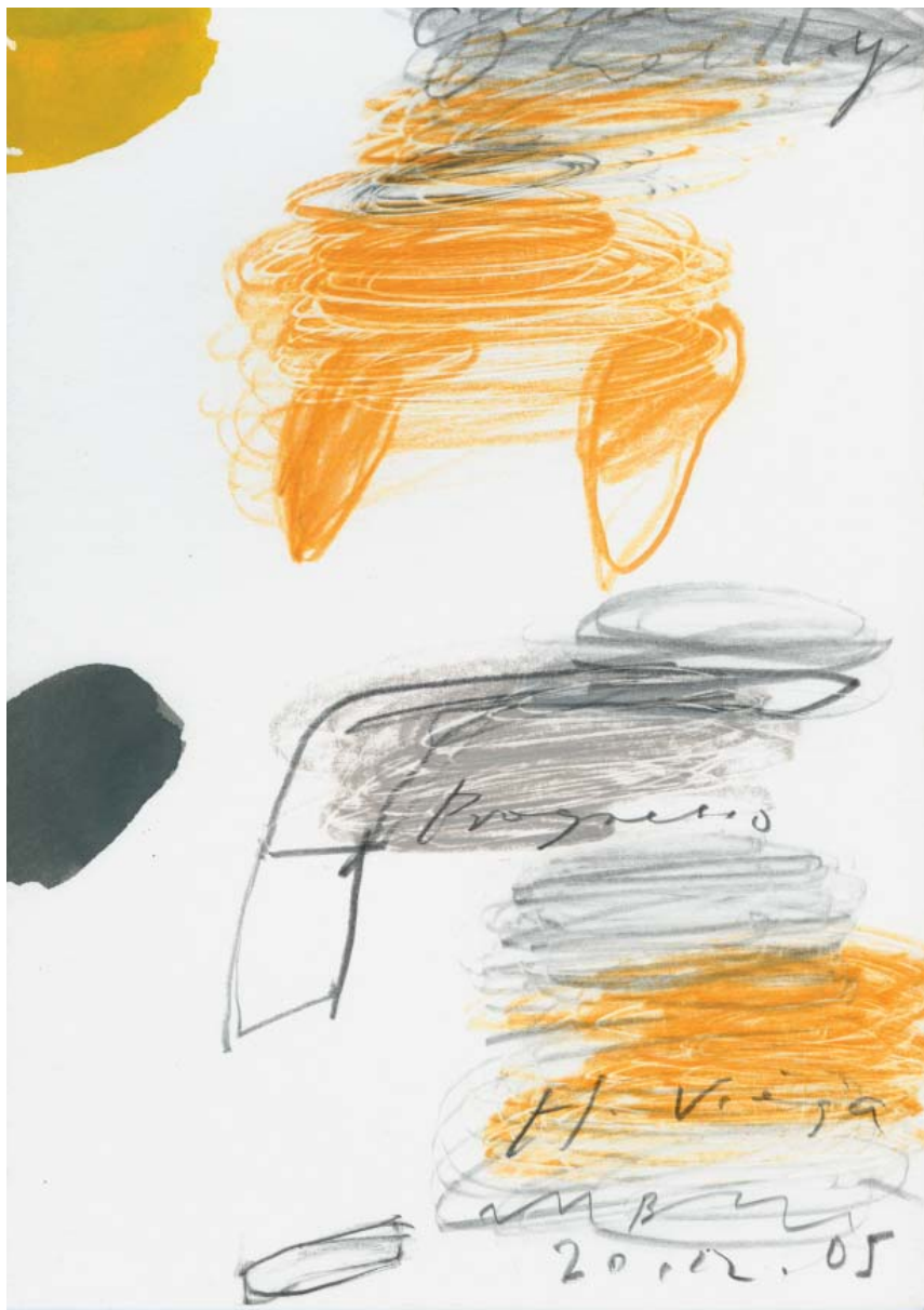
Figure 6 Mostyn Bramley-Moore, 2005, Progresso , pencil and watercolour on paper, approx. 25 x 35 cm.

“He made them every day, of the everyday, thousands of days, thousands of drawings. What is the everyday? ... [They are] constituents of Bonnard’s own everyday life... Bonnard seems to love the immeasurable illusion of the everyday passing in Time. The constant rubbing of the surface as he works, is his way of invoking the phantom of Time...through the endless exchange between [his body] and the material...” (Phillipson & Fisher 1999: 125-7).