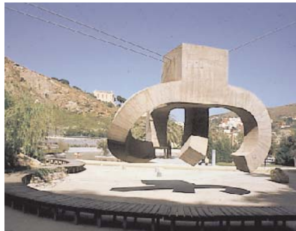
Figure 2 Eduardo Chillida, In Praise of Water, 1987. Parc de la Creueta del Coll, Barcelona, top of Spain.

Many quarries, a result of strip mining, have undergone reclamation. These projects underline the above intention, particularly with regard to land formation and the scale of intrusion resulting from these mining activities. The most obvious signs of mining exploitations are dump heaps and terracing structures. The Eden Project 10 in Cornwall, south west England and Parc de la Creueta del Coll 11 in Barcelona, are the result of such reclamation projects. Both the old Creueta del Coll stone quarry and the extensive abandoned china clay pit Bodelva, the site of the Eden Project, have been transformed into popular places of sociation through elaborative interdisciplinary collaborations. The fundamental financial, structural and practical principles in both projects were to take full advantage of the sites' original exploitation and resultant formations. By enhancing the particularities of each site, the underlying industrial