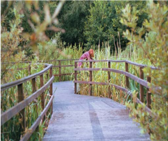
Figure 15 Seen & Unseen: 1995-1997. Quaking Houses Wetland - a collaborative community project for the rehabilitation of the Stanley Burn, County Durham, north east England.