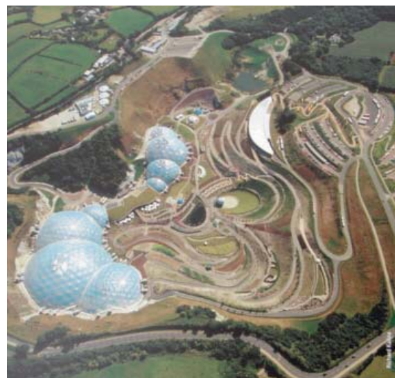
Figure 4 The Eden Project, near St Austell, Cornwall, England (Photo: W Ross, of the information poster at Eden).

Bodelva, (figure 3) one of the many disused sprawling clay pits that scar the east Cornwall landscape, provided an ideal location for the Eden Project (figure 4) as the largest conservatory in the world so that plants, “even the humble potato”, could tell their stories that could fire the imagination. What evolved was “a living theatre of plants and people” (Smit 2001: back cover). The final result was multi-dimensional and regenerative: by exploring the synergy between people, recreation, gardens, the arts and environmental education, the project focuses on the interdependence between people and the planet. One experiences art as central to the intention, particularly as a mode of environmental education for both young and old, through storytelling, festivals, sculptural and technological installations, relevant exhibitions and various participatory