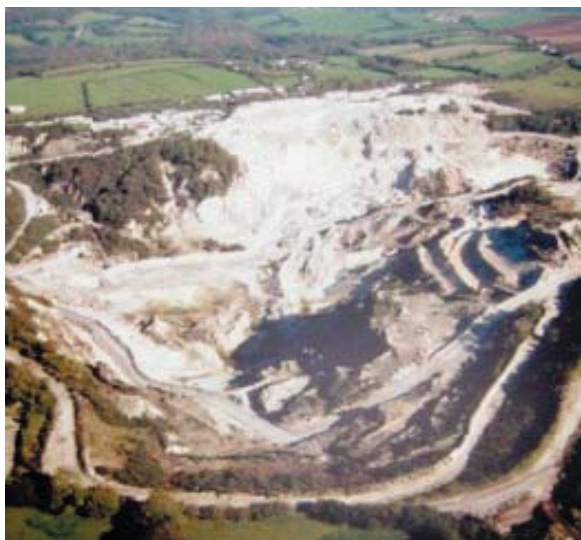
Figure 3 Bodelva, the disused china clay pit near St Austell, Cornwall, England (Photo: W Ross, of the information poster at Eden).