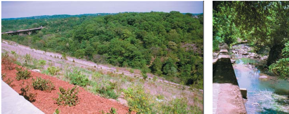
Figures 11 & 12

Environmental art today has four main aspects: art which reclaims polluted or damaged land; art which draws attention to threats to habitat and diversity of species; art which works practically to heal the land of pollution; and art which foresees alternative futures (in Kemp et al 1999: 122).