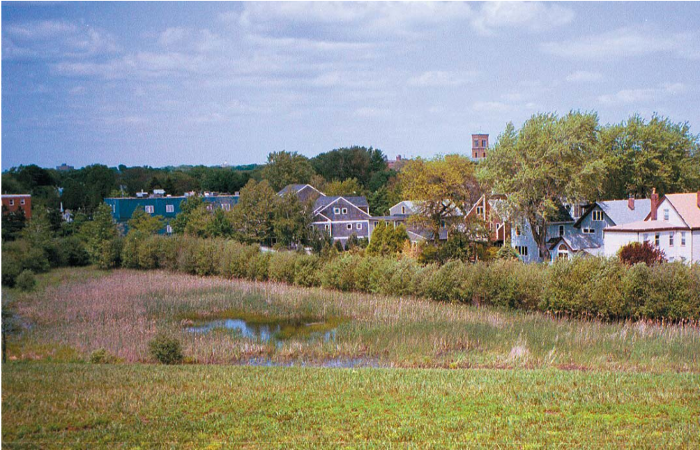
Figure 7 Merle Laderman Ukeles, Turnaround/surround , 1989 - ongoing. Wetlands, situated around the boundary of the park, filter and purify polluted water seepage from the landfill .