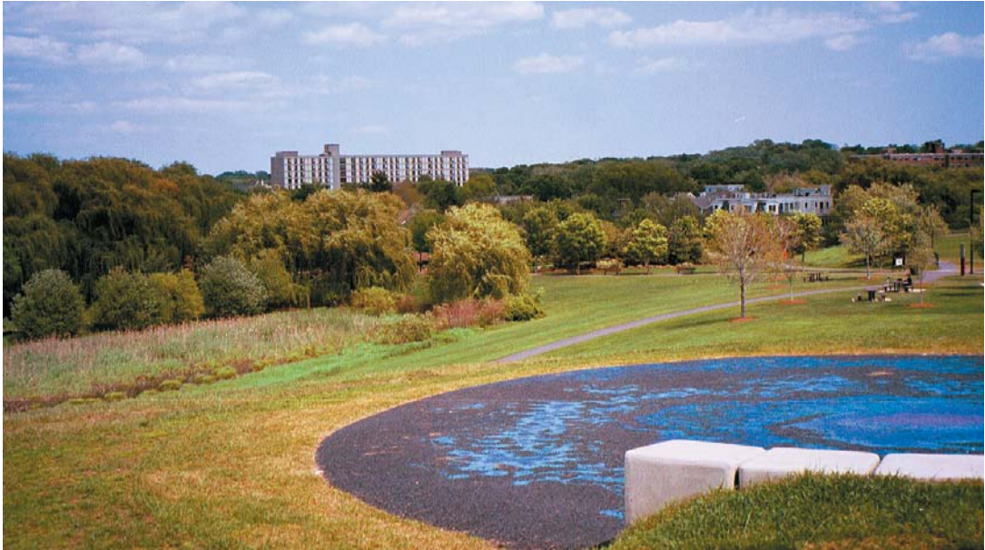
Figure 6 Merle Laderman Ukeles, Turnaround/surround , 1989 - ongoing. Rehabilitation of a landfill site, Cambridge, Massachusetts, USA. The Galaxy dance floor is in the foreground with the wetland area at the lower edge of the park.

conceptualised the childhood game of King of the castle around this outlook point. Treasures (personal items of memorabilia) donated by local residents were embedded in the hill while two sculptural thrones and The Galaxy dance floor (figure 6) with its yellow and blue design based on a stellar constellation, cap the mound. To enhance the sense of grandeur, a sparkling carpet of glassphalt 14 , developed as part of a crushed-glass recycling project, leads up to the site. A final two-month long community engagement programme, planned by the artist as a “hand-over ritual”, will represent the cultural mix of the residents in the area.