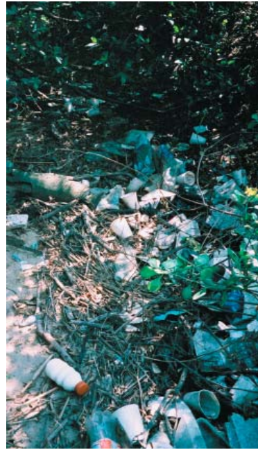
Figure 17 Beechwood mangrove swamps: pollution washed down into the Umgeni River Mouth.

These international examples set important precedents for presenting a pro-active role in environmental remediation and community education in South Africa. Without slavishly following international trends, the uniqueness of the African landscape combined with a concern for land degradation and water pollution, offers many opportunities for particularised art interventions that address environmental remediation. There is certainly no lack of polluted or degraded areas: abandoned quarries exist nation-wide, water pollution is rife, and plastic covers the land like a blanket. Art in history reveals that creative people have always played a role in the development of a society. Given a public context from which to operate, creative expression gave voice to political, spiritual, historical and social concerns of every culture. Alternative interdisciplinary creative interventions that are collaborative can assist in changing attitudes through participation, thereby encouraging a paradigm shift to a state of mindfulness where we walk lightly on this planet .