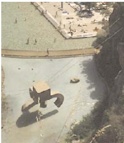
Figure 1 Parc de la Creueta del Coll, Barcelona, Spain. 1994. View from the the quarry.

By the early 1970s, Land Art was playing an influential role in land reclamation in which art mediated between environmental understanding and the need for natural resources 8 . However, artists were concerned about complicity and the possible cover up of exploitive practices as well as the dissipation of corporate responsibility 9 . Robert Smithson, one of the earliest protagonists of land art and reclamation projects, believed that these artworks could create a dialogue between environmental issues and the value of aesthetic solutions in relation to industrial land devastation (Hobbs 1981). Smithson's philosophy behind these interventions could be said to “emphasize the changes, establishing and maintaining a dialectic between industrial ravages and bucolic reclamation, acting as a fulcrum to keep in suspension the two opposing states” (Hobbs 1981: 219).