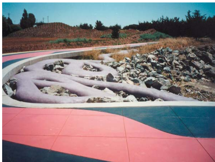
Figure 10 Patricia Johanson, Ribbon worm tidal steps – a complex inter-tidal ecosystem.

Speaking of environmental art today, Malcolm Miles states: