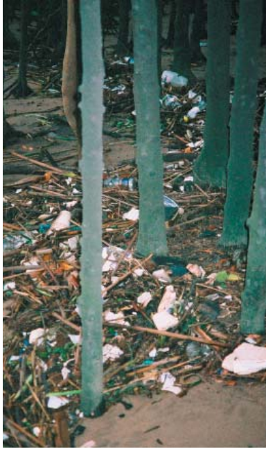
Figure 16b Durban Bay Head Mangrove swamps: pollution into the Bay by the tides.

are to make any significant difference in this and other similar countries, we need to initiate awareness campaigns that become part of our everyday lives in our homes, at play and in our public spaces. I am unaware of any artists in South Africa presently conducting environmental research or creating ecologically-based arts interventions 18 .