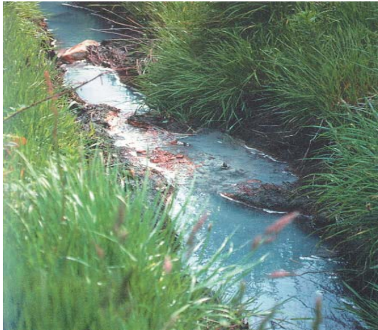
Figure 16a Polluted water in the Stanley Burn.

Similarly, Seen & Unseen (figures 15 & 16), near Durham, north east England, was another wetland solution to mine dump seepage and was an alignment between people and place that resulted in an ongoing environmental arts and science programme uniting communities and professionals from various institutions. North east England has suffered much environmental and social degradation due to the closures of coal mines and the decline in the shipping industry. Determination by local communities to improve the environment, and in this instance, to regenerate and rehabilitate the local waterway, the Stanley Burn and its surrounding natural habitats, resulted in this collaborative pro-active intervention. Quaking Houses village appears to be located in a rural setting but beneath the surface the unseen legacy of the mining industry continues to degrade the area as pollutants unrelentingly seep into and poison this small local stream (figures 16a and b).