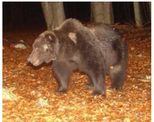
Fig. S2 Examples of Body Condition Score applied to selected camera trap images (rescaled from the original size to reduce background) of Apennine brown bears ( Ursus arctos marsicanus ).