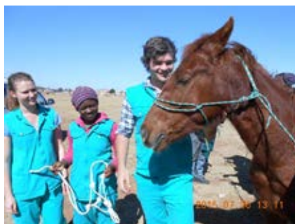
Veterinary students enjoyed interacting with the equines of Orange Farm.

The aim of our project is to offer sustainable improvement to working equine welfare in township areas. This is to be achieved by encouraging the owners to address equine-related issues using a community-led approach to encourage a reduced reliance on free services provided by organisations such as the HHCU. Owners in the target areas need to be educated in treating their equines in a welfare-friendly manner that demonstrates good knowledge of husbandry, first aid, health and foot care and making use of good quality service providers when required.