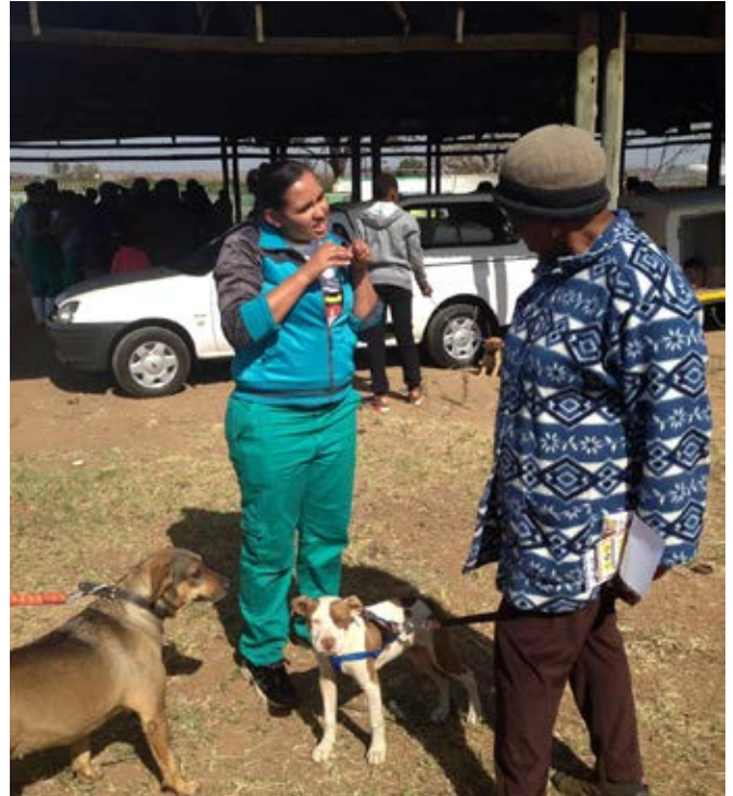
A veterinary student advises a community member on caring for her pets.