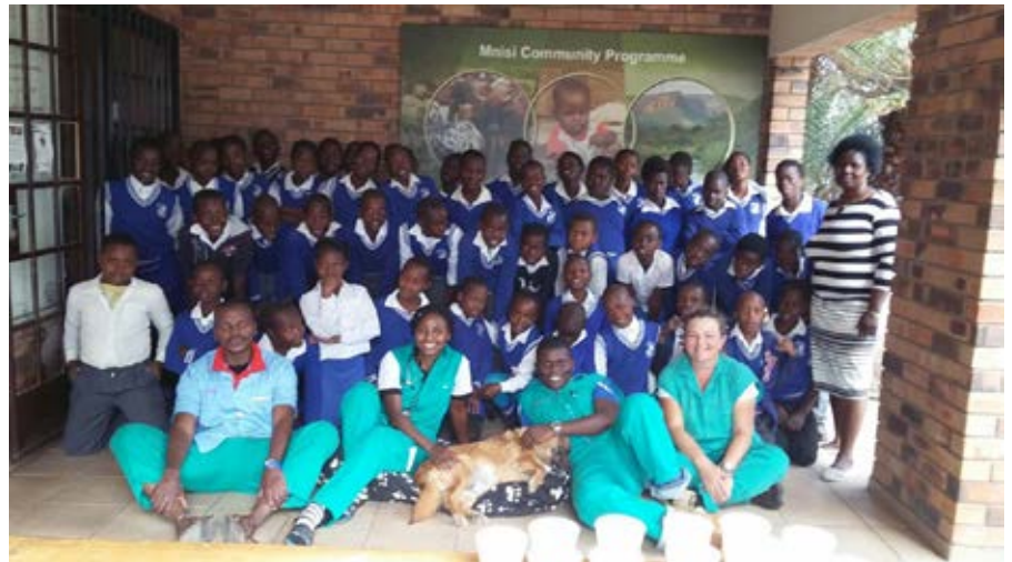
Vet students with Manyeleti Primary School teacher and learners.

Session 3: "Lady" the HAHC pet enjoyed playing with her new friends. After working so hard, we finished our day by taking a group photo and enjoying refreshments. Learners were also given some treats to enjoy on their way home.