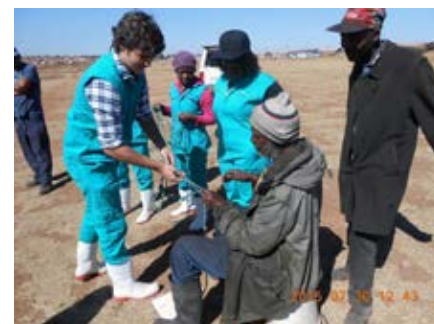
Students also had the opportunity to interact with farmers and community members about equine care.

A total of 16 owners from one coal yard were trained by the students. Their presentations were well thought out and