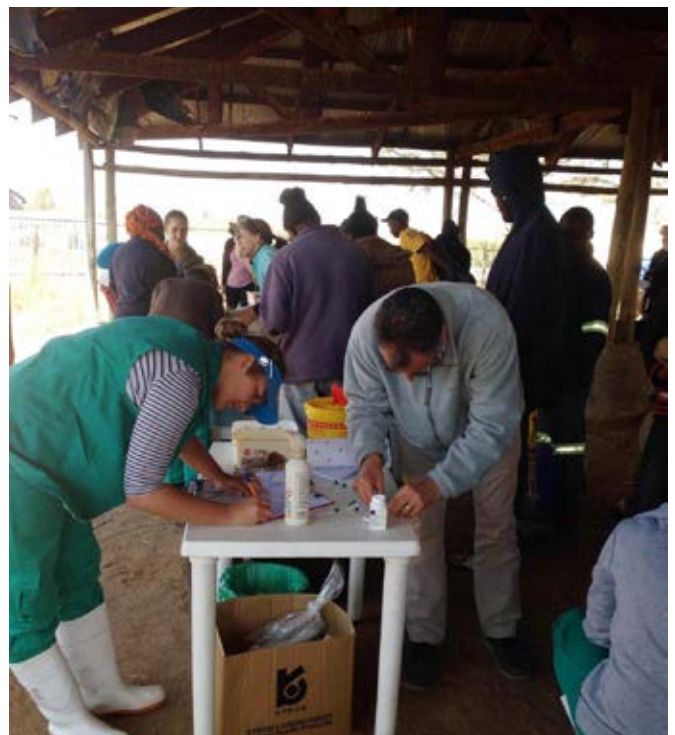
Students hard at work in the Loate Community Veterinary Clinic.