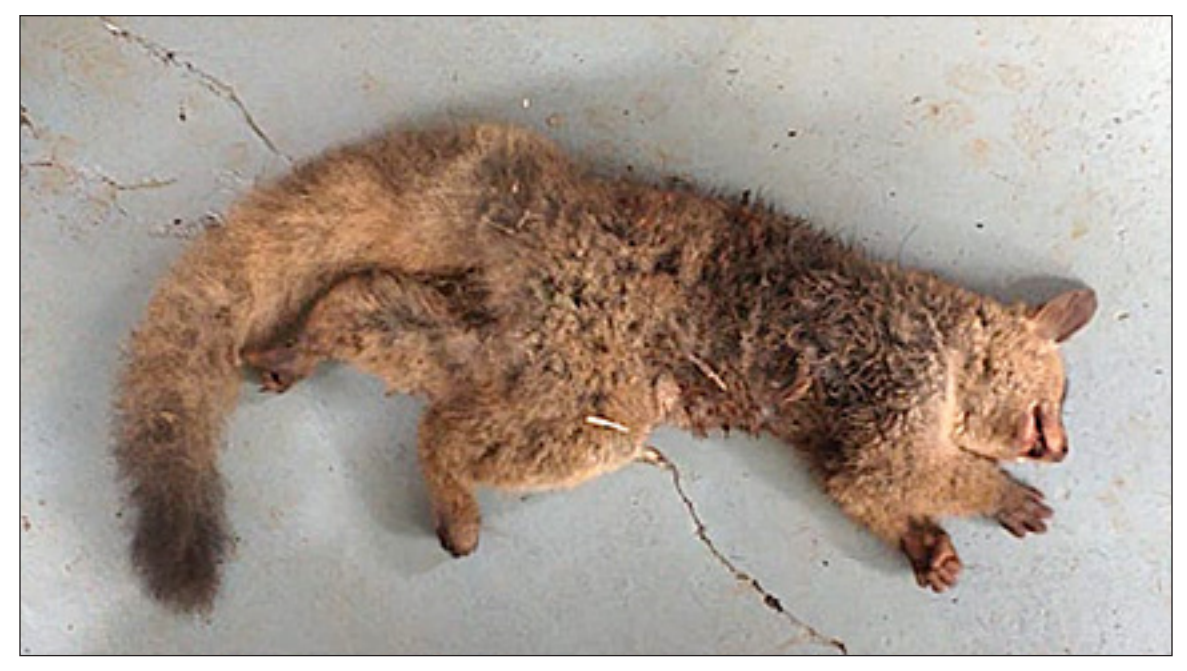
Figure 2. Otolemur crassicaudatus killed by a domestic dog (March, 2022) in a garden of a residential area of Louis Trichardt, South Africa.

large open area, to obtain food, and therefore being susceptible to domestic dog attack.