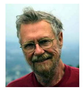
Figure 2 Edsger Dijkstra

In 1972, the programming scene was dominated by languages such as Fortran, Algol, Cobol and PL/I. IBM (Big Blue), with its strangle-hold on software bundled with hardware, was the enemy of academics – a mantel that it has since been relieved to pass on to Microsoft. The Garmisch Software Engineering Conference had taken place four years ago, and people were well aware that there was a software crisis looming.