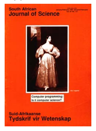
Figure 3 Cover of the SAJS Issue, January 1991

"Teaching to unsuspecting youngsters the effective use of formal methods is one of the joys of life because it is so extremely rewarding. Within a few months, they find their way in a new world with a justified degree of confidence that is radically novel for them; within a few months, their concept of intellectual culture has acquired a radically novel dimension." [6]