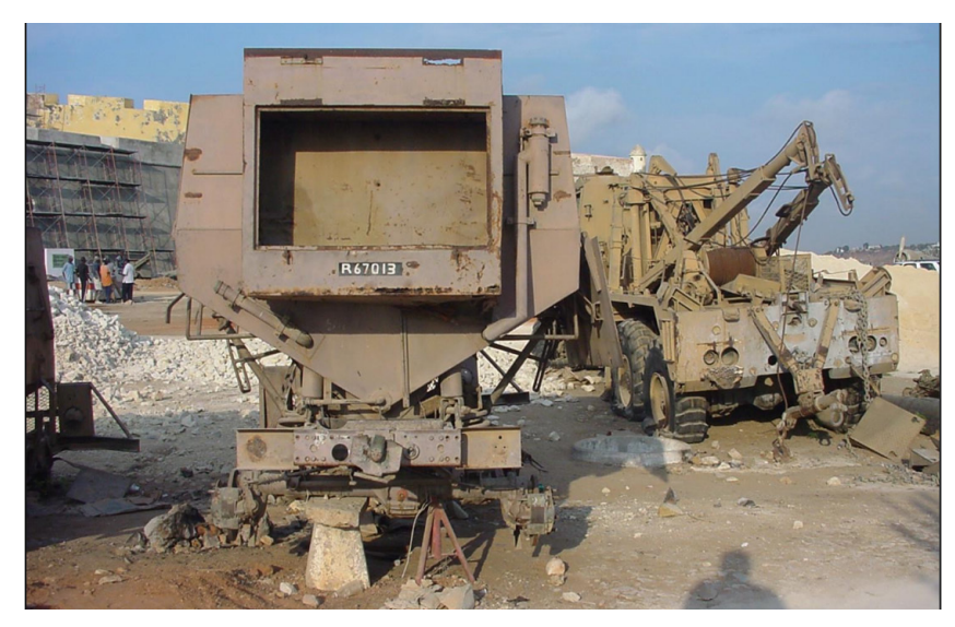
Figure 3: Photograph of a Buffel and Withings recovery vehicle that were displayed at Luanda after the war. The Buffel is probably the vehicle which the SADF abandoned at Indungo.<sup>268</sup>

According to the report of the SADF, the task force was unable to recover or destroy the stricken vehicle, <sup>266</sup> and the intact Buffel, together with its camouflage net and some equipment, was left behind at the target area. The abandoned Buffel was a significant find for FAPLA, and the vehicle was also later displayed at Luanda. <sup>267</sup>