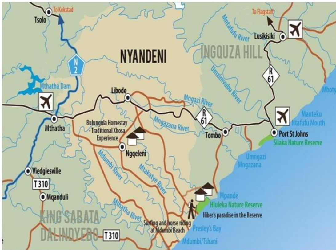
Figure 1: Nyandeni Local Municipality Map

Maize is amongst the prominent crops in Nyandeni, being grown by almost every farming household within the region. As such, some of the farmers in Nyandeni benefited from various FSPs, by receiving production inputs (seed, fertiliser, mechanisation etc.), cattle exchange and extension services. According to ACB (2018), smallholder farmers are required to formulate local project groups in order to qualify for FSP support. In addition, smallholder farmers should be from a disadvantaged background to qualify. Given the background of Nyandeni's population, most smallholder farmers in the region qualify to receive FSP support.