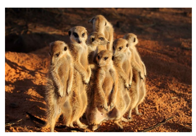
FIGURE 1 Family unit of cooperative breeding meerkats ( Suricata suricatta ) photographed at the Kalahari Meerkat Project (KMP) in the Kuruman River Reserve, Northern Cape, South Africa

Kalahari meerkats are cooperative breeders living in groups of 2–50 including an unrelated (or distantly related) breeding pair, which are dominant to all other group members of the same sex, and a variable number of closely related and highly familiar non-breeding subordinates of both sexes that help to rear young born to the breeding