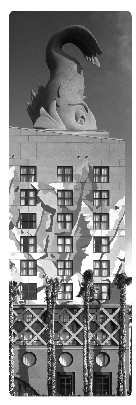
Figure 5.5 - Applied, themed decoration Figure 5.6 - The central triangular wing