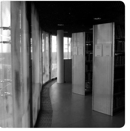
Figure 5.3 - Facade as continuous, unbroken skin