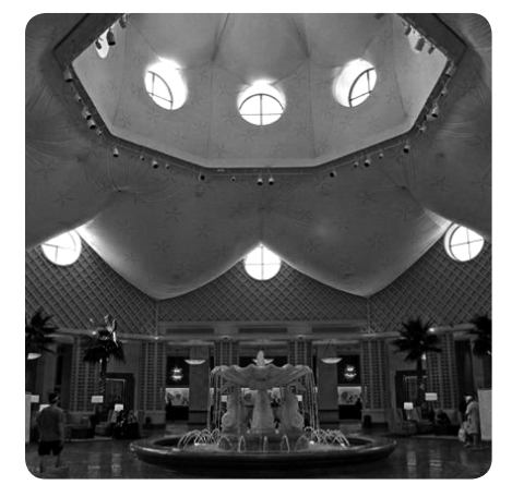
Figure 5.8 - Superficial use of water

Figure 5.9 - Ironically cheap decoration