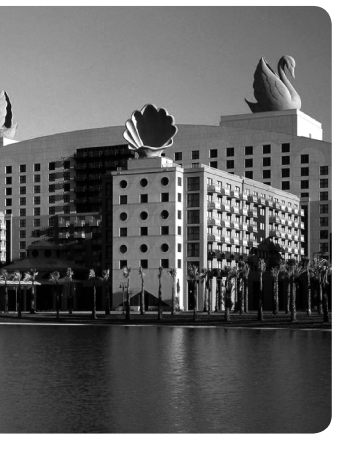
Figure 5.7 - Inhumane scale of the hotel blocks