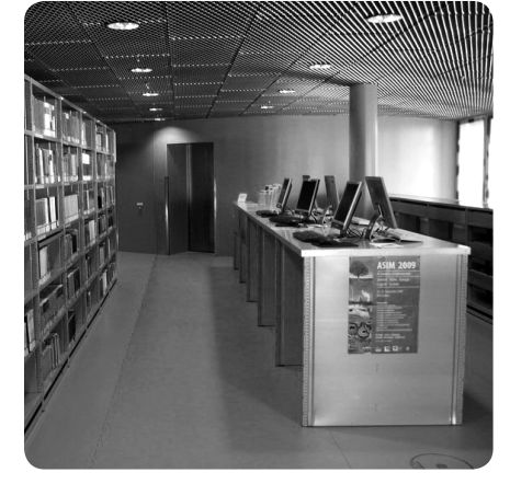
Figure 5.4 - Using colours to define space