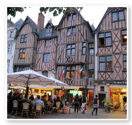
The old town square in Tours, France, surrounded by the old wooden buildings for which the city is famous. Tours is situated in the heart of the Loire Valley.

Networking with delegates at both conferences resulted in a number of potential research collaborations.