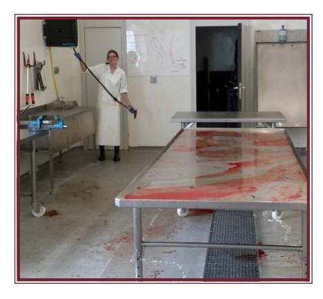
The post-mortem hall.

Travel grants for staff and students will hopefully be possible soon, especially with the upcoming signing of the agreement between UAB and the University of Pretoria.