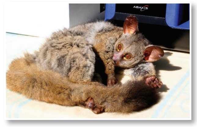
The MH5 haematology device is already used in a project involving bush babies.

These devices are fully portable, which will allow our researchers to set up a mini clinical pathology laboratory in the field. The devices have already been implemented in a project related to bush babies and will also be used in many other projects on wildlife ecophysiology, chemical immobilisation and anaesthesia, as well as wildlife health and production. The company's total sponsorship amounts to about R650 000.