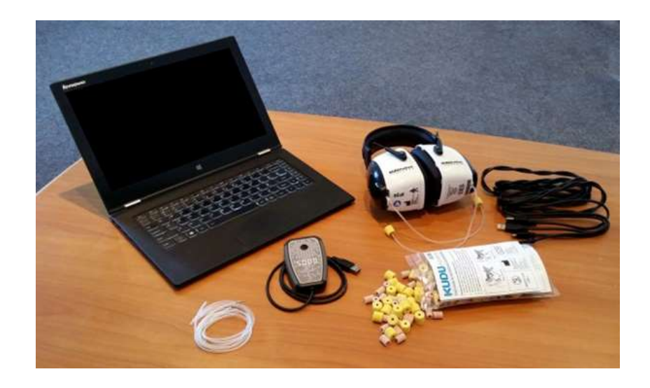
Fig. 1 . KUDUwave 5000 Audiometer showing insert earphones, circumaural headphones, laptop computer and patient response button.

thresholds did not require masking. Bone conduction audiometry was not included in this test battery. Instead, otoscopy and patient history was used to distinguish conductive from sensorineural loss. The Pure Tone Average (PTA, 0.5, 1, 2 and 4 kHz) for each ear was recorded.