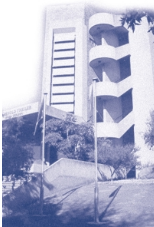
Arnold Theiler Building

Academic history will be made in December this year at the Faculty of Veterinary Science, University of Pretoria, when the graduating Class of 2001 takes the Veterinary Oath for the first time. The ceremony will be a formal occasion, attended by the Dean, academic and support personnel from the Faculty, the President of the South African Veterinary Council, the President of the South African Veterinary Association and other dignitaries. The oath that the new graduates will take is set out in the column to the right: