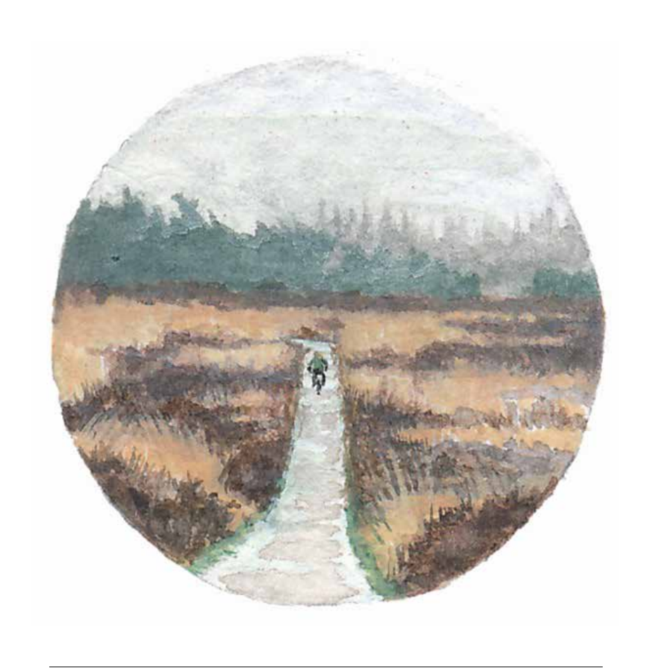
FIGURE 9.1 Day 154, Cyclist (Lorraine Loots, 2013)