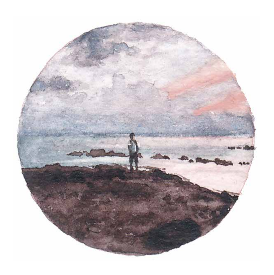
FIGURE 10.1 Day 121, Thong Sala Pier (Lorraine Loots, 2013)