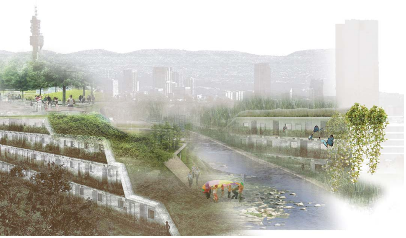
Figure 1.9 ~ Interface.jpg Intention, establishing a new urban interface and connection with the landscape.