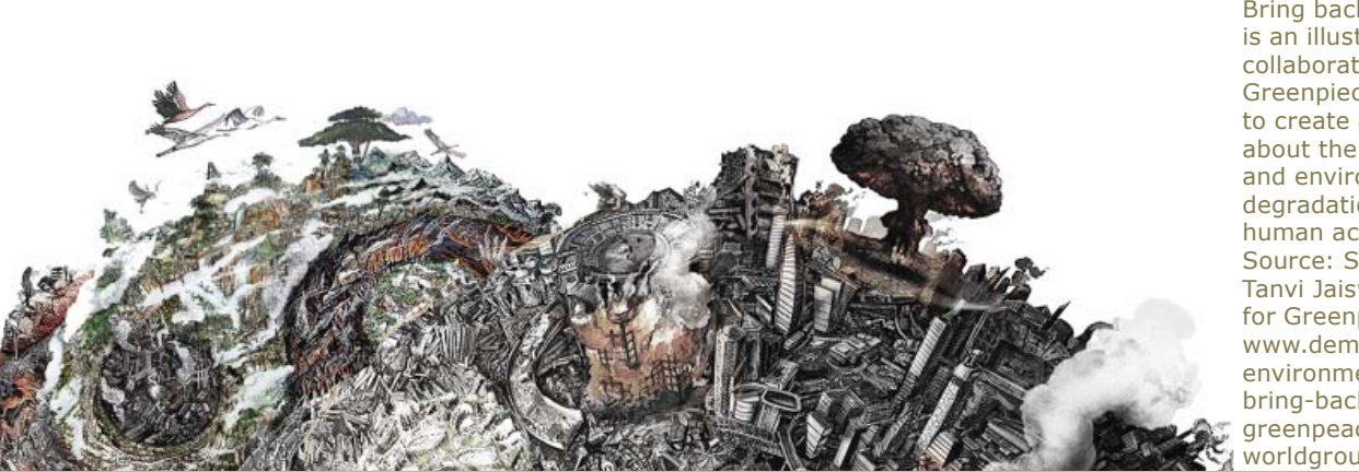
Figure 1.3 ~ Bring back the balance.jpg Bring back the balance is an illustrated collaboration by Greenpiece artists to create awareness about the imbalance and environmental degradation created by human activity.

Current-day urban and suburban form, which has evolved over the last century, greatly differs from preceding human