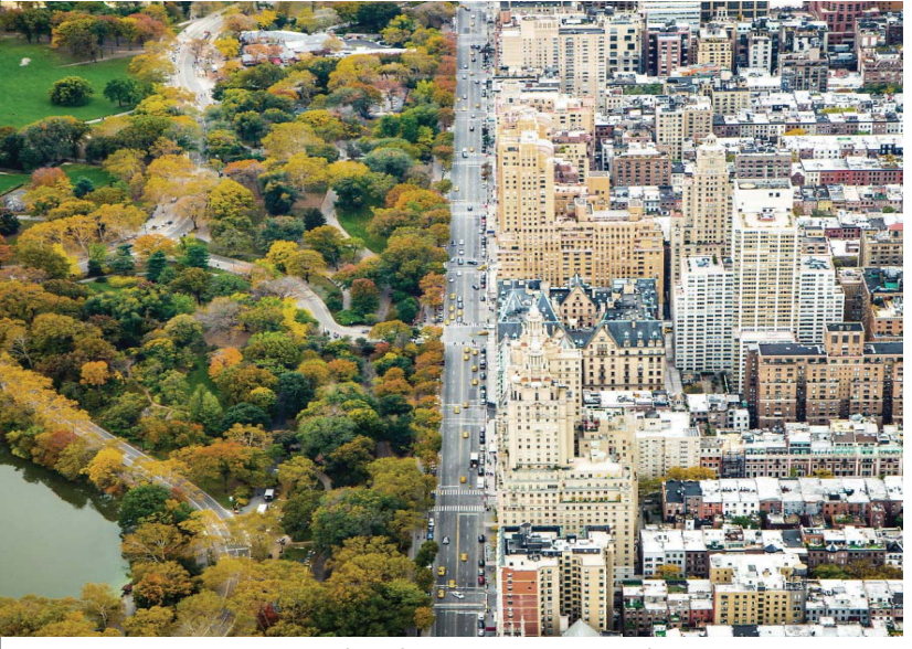
Figure 1.2 ~ Central park contrast - New York City.jpg Central Park in Manhattan New York designed by Frederick Law Olmsted in 1858.

View over southern gateway of the city, with Unisa in the foreground. At a glance an abundance of greenery and natural spaces appear to filter into the city, but upon closer inspection one finds that the city is severed from its natural landscape.