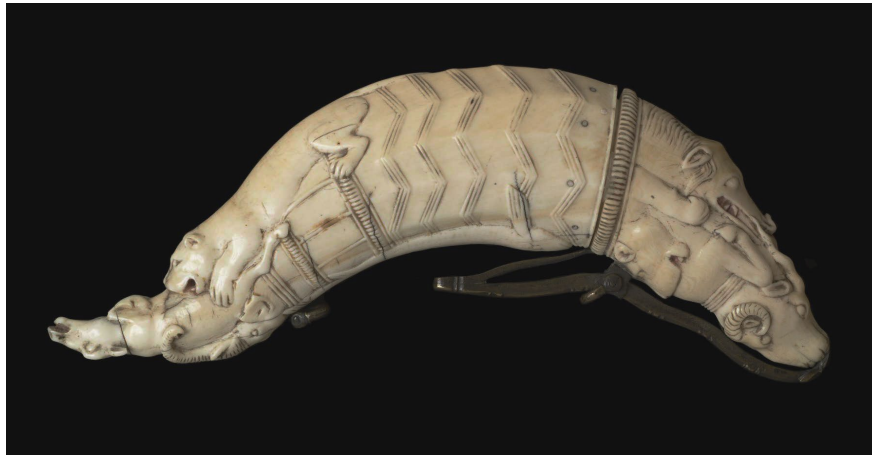
Figure 1.4 An ivory flask for black powder.