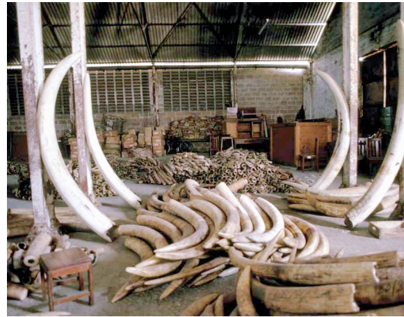
Figure 1.5 Ivory stockpile in Tanzania, 1988.