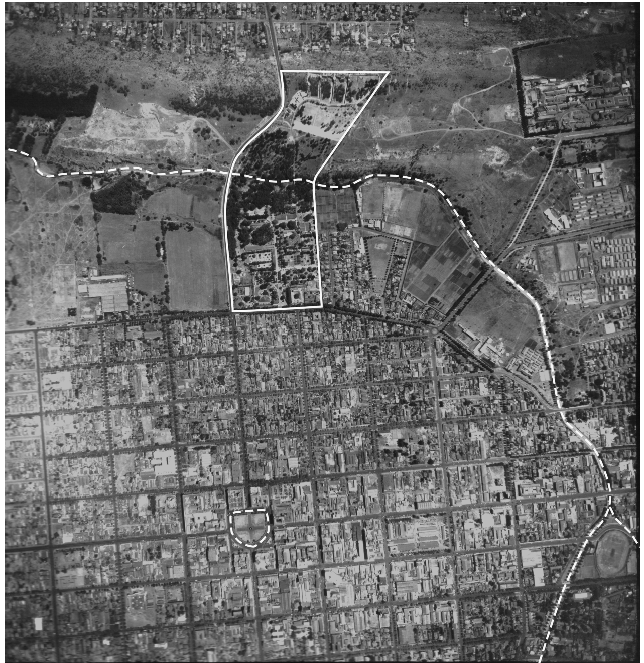
Figure 1.11 1947 Map of Tshwane, showing the zoo's relation to Church Square and the Apies River (Author & Water Group, 2016).

These rituals form an important factor of city life and cannot be disregarded. The framework therefore proposes a space where rituals are celebrated and formalised through architecture. Public spaces for these rituals help to expose the result of non-ownership to establish a new river identity in the city and for the individual: an everyday river for everyone.