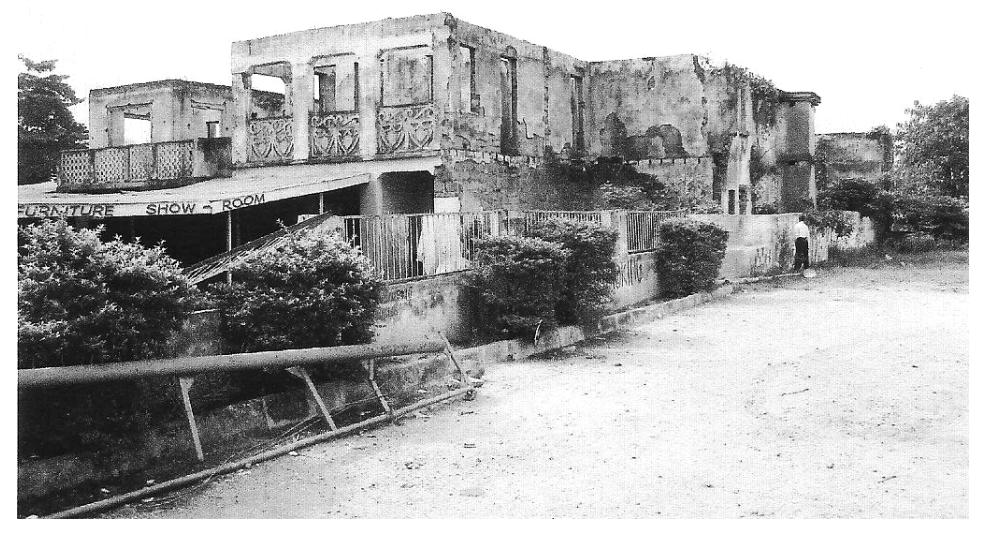
FIGURE 4: Lagere. Private property adjoining a filling station, razed during the local war. Recently acquired by a furniture company, the premises are gradually coming back to life.