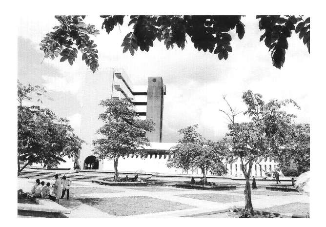
FIGURE 1: Obafemi Awolowo University 'motion ground' – the piazza where professional photographers ply their trade. In the background is the university's 9-storey secretariat building.

As previously-mentioned, there are three clearly-distinguishable locations where noticeable urbanizing development is taking place in Ile-Ife, each with its own unique characteristics: the first, the OAU campus; the second, the Mayfair-Sabo commercial spine; the third, the inner core. Though, in physical terms, each area is distinct, they are inter-dependent and spontaneously inter-relate, producing a synergy that is cumulatively transforming the physical, social and economic fabric of the whole town. The following is an analysis of these 'nodes'.