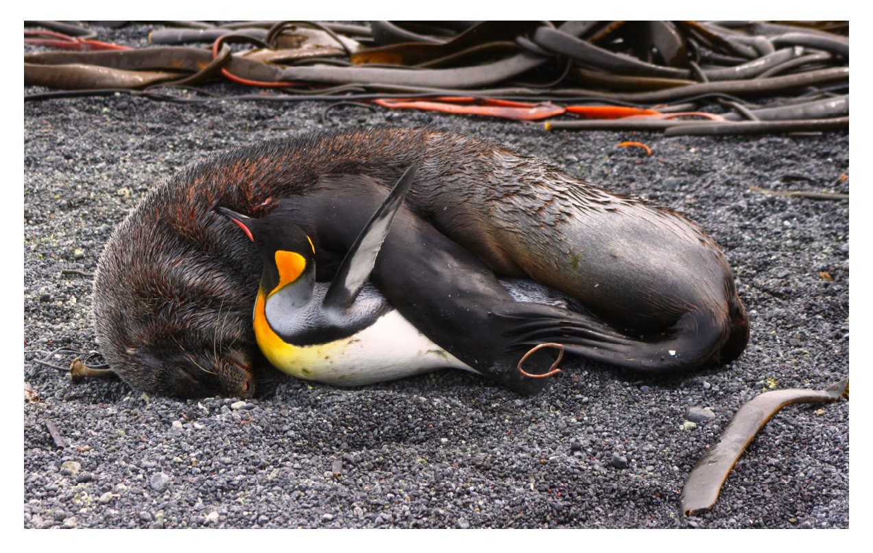
Fig. 1b Antarctic fur seal ( Arctocephalus gazella ) between copulation-attempt bouts while sexually coercing a king penguin ( Aptenodytes patagonicus ).