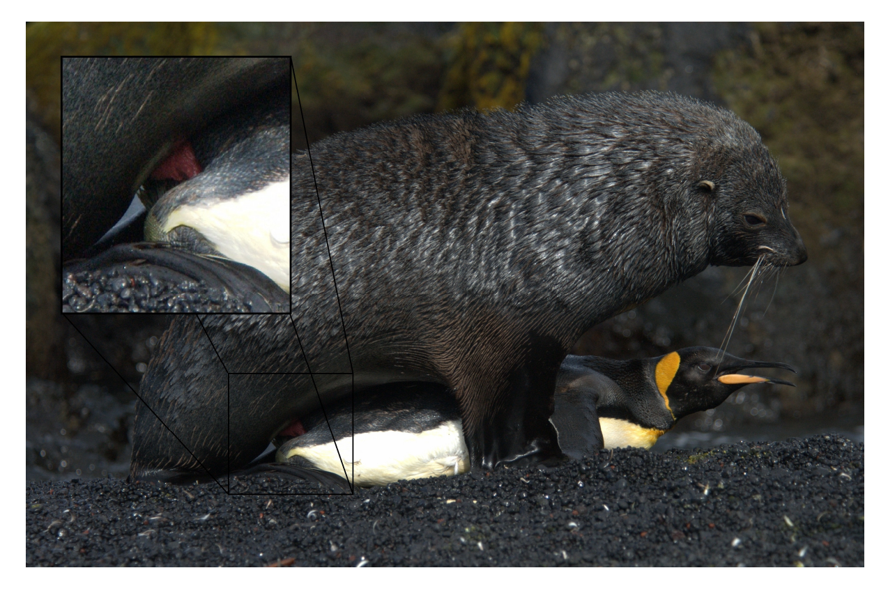
Fig. 1a The erect penis of an Antarctic fur seal ( Arctocephalus gazella ) clearly visible while attempting to copulate with a king penguin ( Aptenodytes patagonicus ). (R.R. Reisinger)