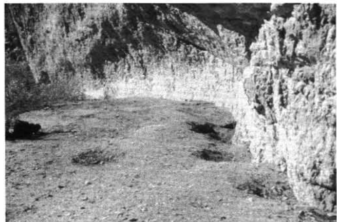
FIG. 1. Rockshelter where the individual was found.

Fragments of a thin rope made of the fibres of the plant