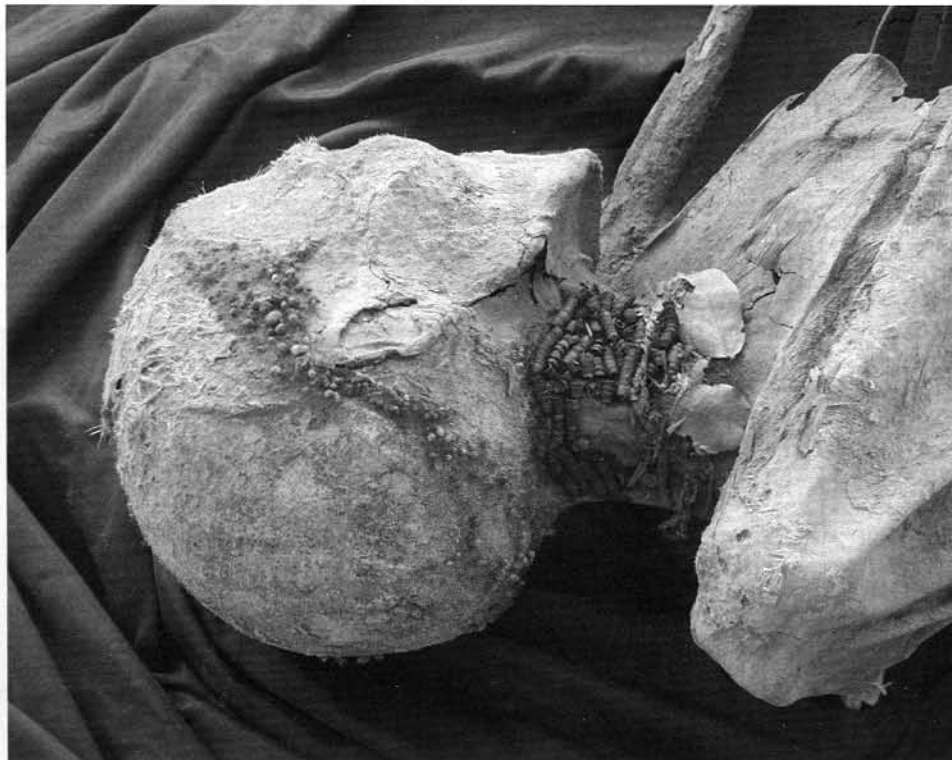
FIG. 3. The seed beads around the neck.

The aim of this analysis is to provide a basic description of the remains, including age and sex. Gross morphological characteristics were therefore observed, and where possible standard anthropometric measurements were taken (Buikstra & Ubelaker 1994). The measurements were mostly done on the skeletonized sections of the body, using sliding and spreading callipers. As the long bones were measured in situ , a measuring tape was used instead of the traditional osteometric board. An