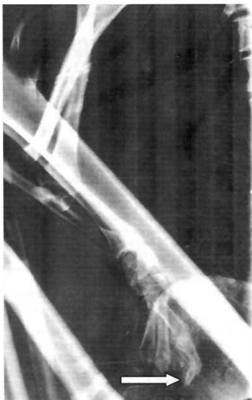
FIG. 6. X-ray image of the amputated last digit of the left fifth finger.

completely exposed, and looked healthy with no signs of subperiosteal bone growth. No cribra orbitalia was present. With gross morphological analysis, it was found that the distal part of the left fifth finger was missing, and initially it was assumed that it was lost as part of the excavation process. However, on X-ray analysis it could be seen that the distal phalanx of this finger was amputated, so that complete healing had taken place at the distal end of the middle phalanx (Fig. 6).