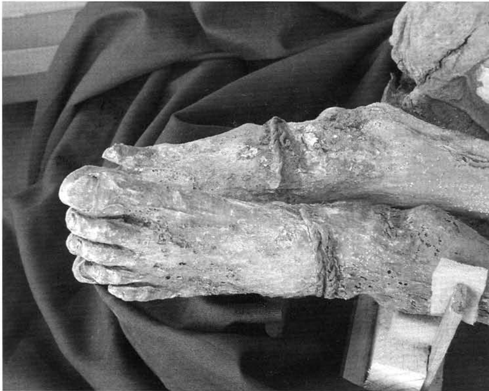
FIG. 2. Close-up of the rope attached to the feet.

Cyperus textilis were found around the feet, stretching backwards to the pelvis area (Fig. 2) Presumably the body was tied up in a flexed position before burial. After the plant coverage was removed, a string of seed beads was found around the neck of the mummy (Fig. 3). The only other grave goods were a few marine shell beads found near the skull. Branches from the grave were radiocarbon dated to 1930 \pm 20 years BP (Pta-7908) and finger bones from the right hand to 2000 \pm 35 BP (Pta-8361).