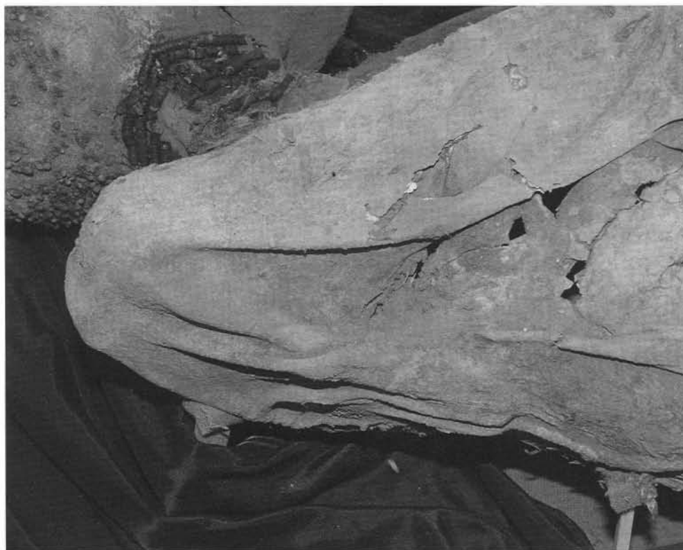
FIG. 5. Posterior view of the mummy, showing the relatively intact skin.

changes could be observed on any of the long bones or vertebrae, also indicating a young adult. This individual was thus most probably an adult between 30 and 40 years of age.