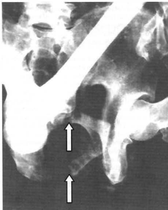
FIG. 7. X-ray image of the pelvic fracture. Note the spaces between the medial and lateral parts of the rami.

According to Wilson and Lundy (1994), recorded statures of recently living San are similar to those of prehistoric individuals. San stature decreased after 3000 BP, and may have increased again after 2000 BP. In their sample of 26 males the mean stature was found to be 151 cm, with four individuals being shorter than 145 cm. Although towards the shorter end of the spectrum the stature of the Kouga male, 145 cm or slightly less, is not unusual for a San male from this time period. In the Wilson and Lundy study all the shorter-than-150 cm males were found to be from the 2000–3000 BP sample. This fits well with the evidence from the Kouga individual. All Khoekhoen males in this study had statures between 150.5 and 176.1 cm, thus making it very unlikely that the Kouga individual was