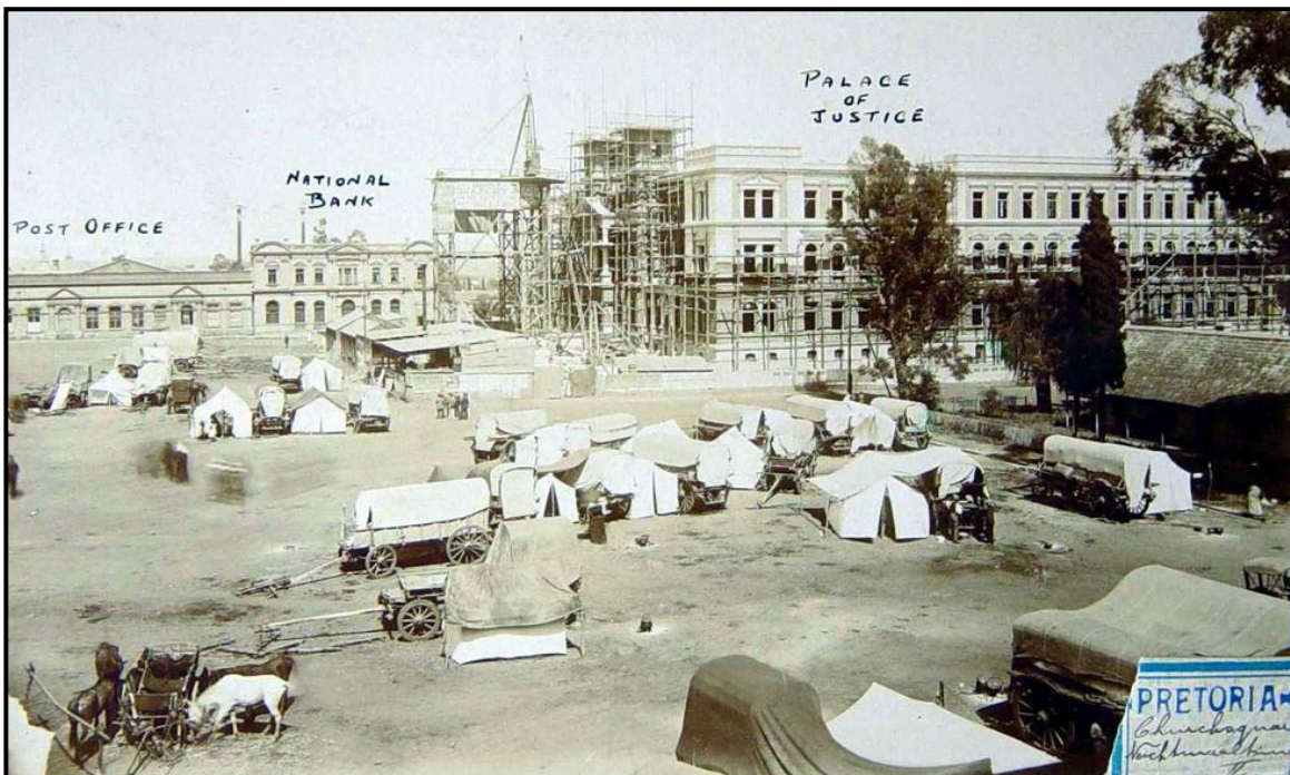
Paleis van Justisie in aanbou