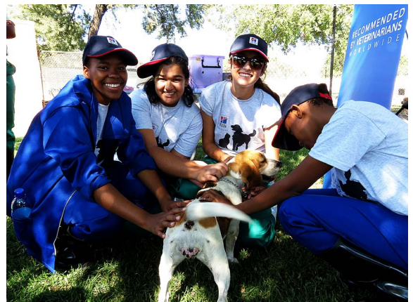
Participants spent time with the Faculty's beagles.

We hosted 46 learners from various schools all over the country on the 4th of March 2016. The aim was to give them an experience of a lifetime by exposing them to some dynamics of veterinary sciences. The learners engaged in various activities, which mainly focused on the basic handling of cattle, dogs, horses, pigs and sheep. They gave positive feedback, which was very encouraging. Most of them made a special mention of the food, which was absolutely delicious. The sheep practical was everyone's favourite. Who would have thought catching a sheep would be that fun?