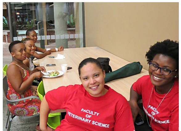
Most of the learners made a special mention of the food, which was absolutely delicious.