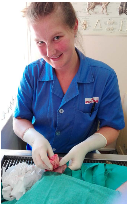
Students get an opportunity to practice their clinical and people skills during this clinical rotation.

The MAHC is situated on the grounds of the Mamelodi campus of the University of Pretoria. This community clinic offers primary health care to the animals (mainly dogs) of the surrounding community at minimal cost.