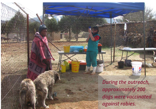
During the outreach, approximately 200 dogs were vaccinated against rabies.