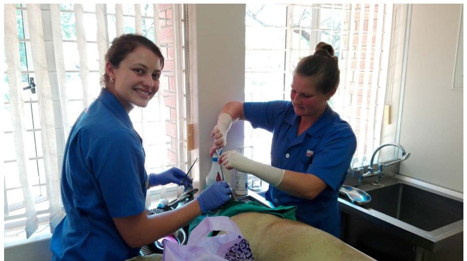
Veterinary students perform a procedure on a patient at the MAHC. This clinic is a true testimony to the passion veterinarians have for their career.

Although MAHC is limited in the drugs and procedures that it is able to provide, I found that the less you have the more you must use your knowledge and instincts in order to give patients the best possible care. In my opinion, the patients at the MAHC are treated just