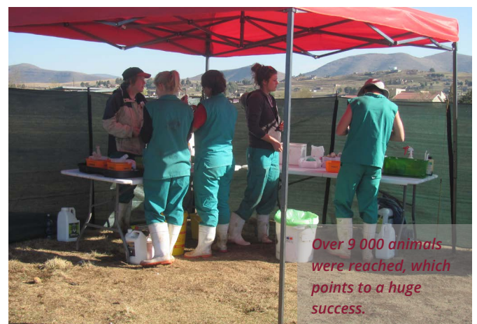
Over 9 000 animals were reached, which points to a huge success.