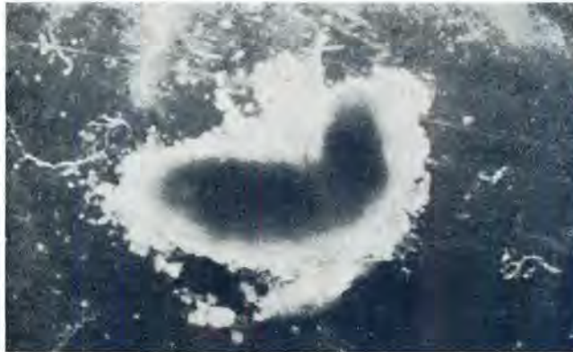
PLATE 5.—Precipitates surrounding a paramphistome incubated in immune cattle serum

Only small quantities of precipitates formed around the worms immersed in serum from paramphistome-free cattle, and in saline the formation of precipitates was delayed for at least 18 hours.