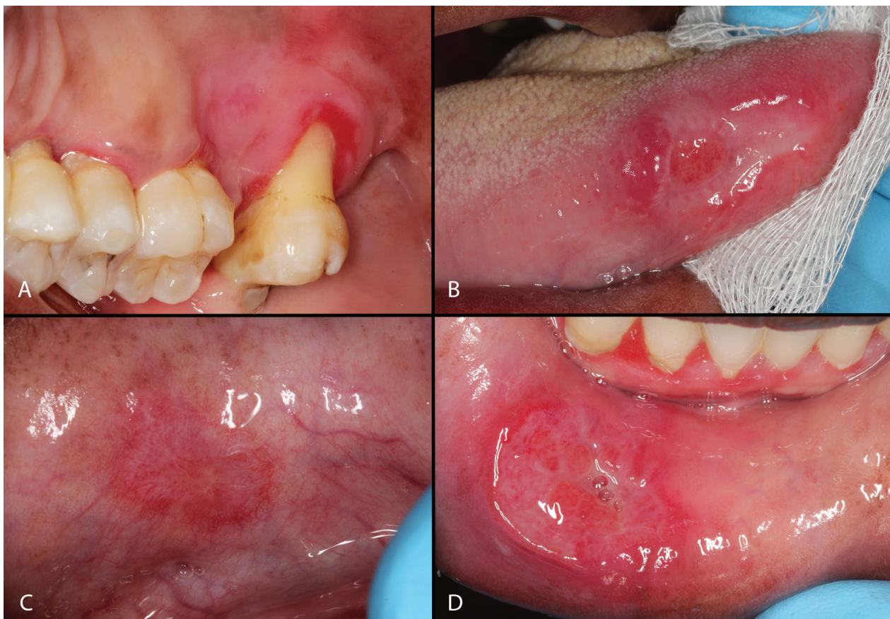
Figure 2: Improvement of most of the lesions after one month.