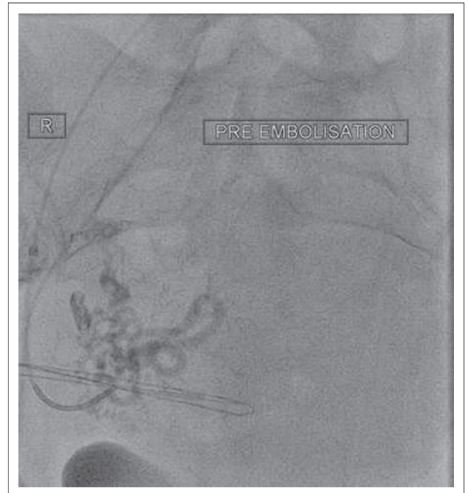
FIGURE 1: Pre-embolisation fluoroscopic image of catheterised uterine artery with contrast injection (AP projection).

All results were reported using descriptive statistics. No advanced statistical modelling was performed.