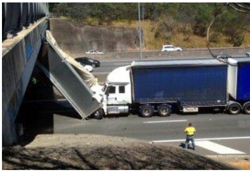
Photo: The crash happened at Anzac Avenue overpass at North Lakes about 9:30am (AEST). 246 The Bruce Highway has reopened at North Lakes north of Brisbane after a crash in which a truck trailer became jammed under an overpass.

The local newspaper or radio, TV and Internet news, would have no fixed meaning but would be subject to the hermeneutics of relativistic reconstruction. This would lead to misrepresentations of what happened, say, in an accident. As this researcher wrote the above, there was an accident that happened on the freeway adjoining the suburb in which he lives: