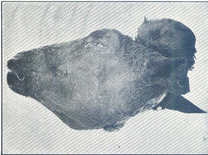
Fig. 1. A parietal tumour in a hamel.