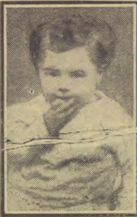
Another child's photograph found somewhere the other side of the Channel.