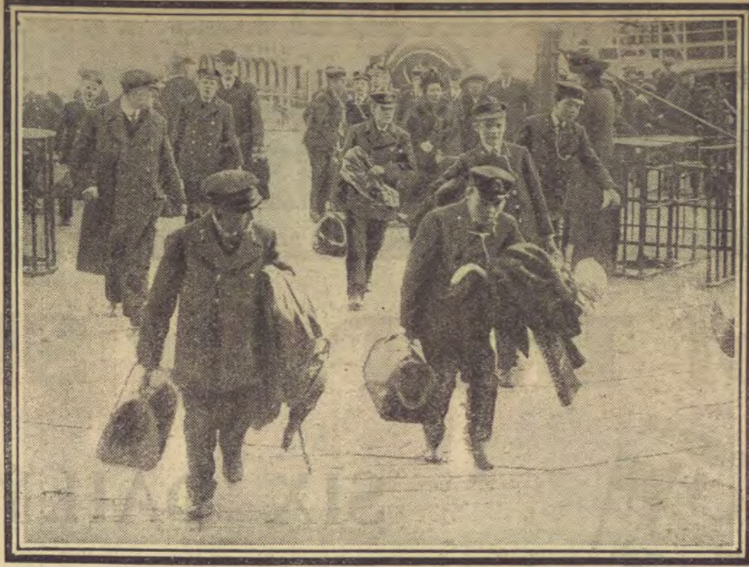
Cadets from Osborne College hurrying off for their Easter holiday.