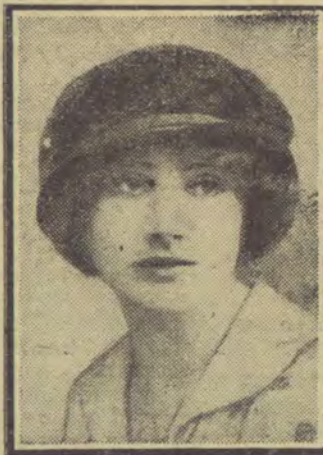
Left in an officer's dug-out on the Western front.