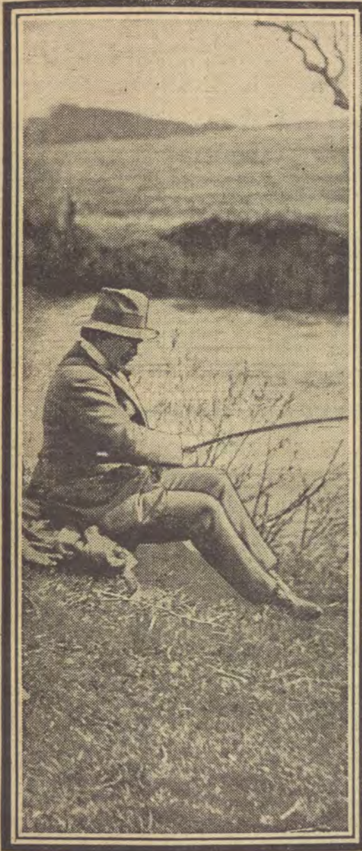
Adopting the Asquithian motto.