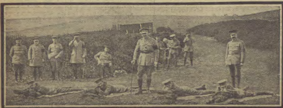
The veterans of the City of London National Guard are spending their Eastertide usefully at Brighton in vigorous military training. Here they are at firing practice.