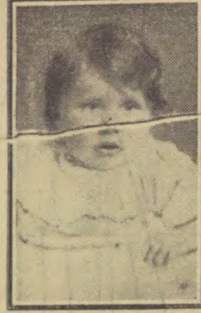
Another relic of our stay in Gallipoli. It comes from Suvla Bay.