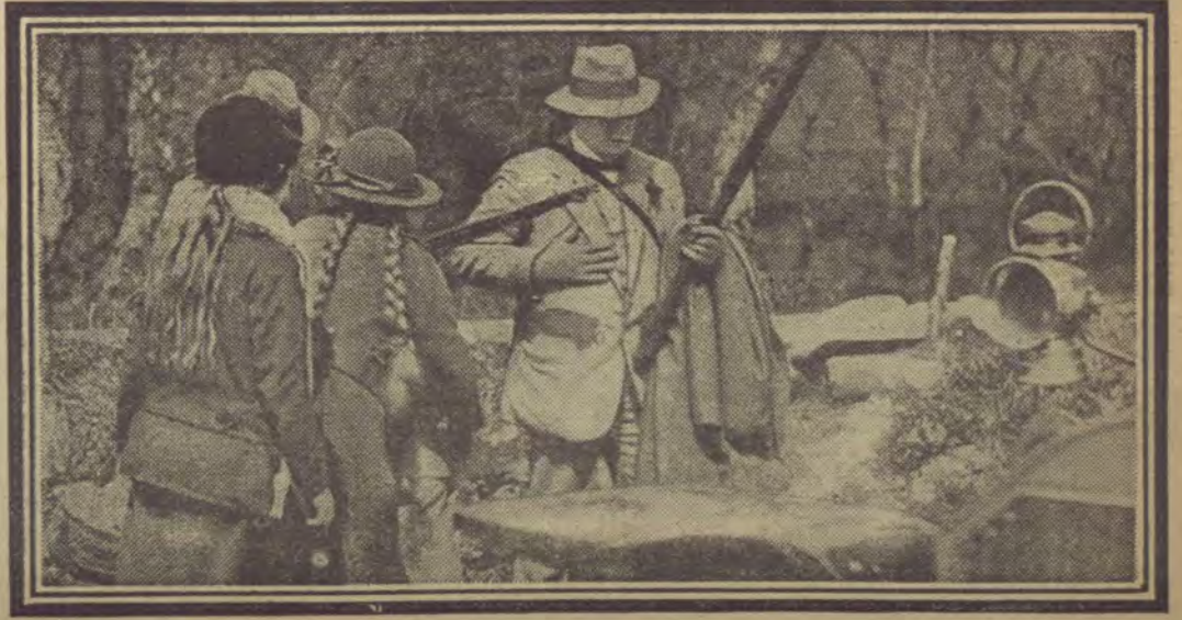
Returning with his daughter Megan and her girl friend with his catch of one fish.

His Easter holiday, not the political situation, made Lloyd George a "wait and see" man. He spent the week-end at home at Criccieth and had a few hours' fishing on the banks of the tranquil Dyvfor—a strange sport for a man who thinks that all men should be in the net. To-day he returns to town determined to "wait and see" no more.