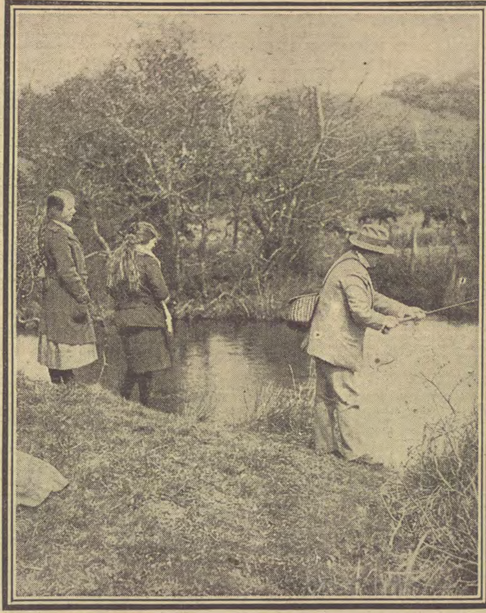
Forgetting war's problems, he enjoys the pleasures of the gentle art.