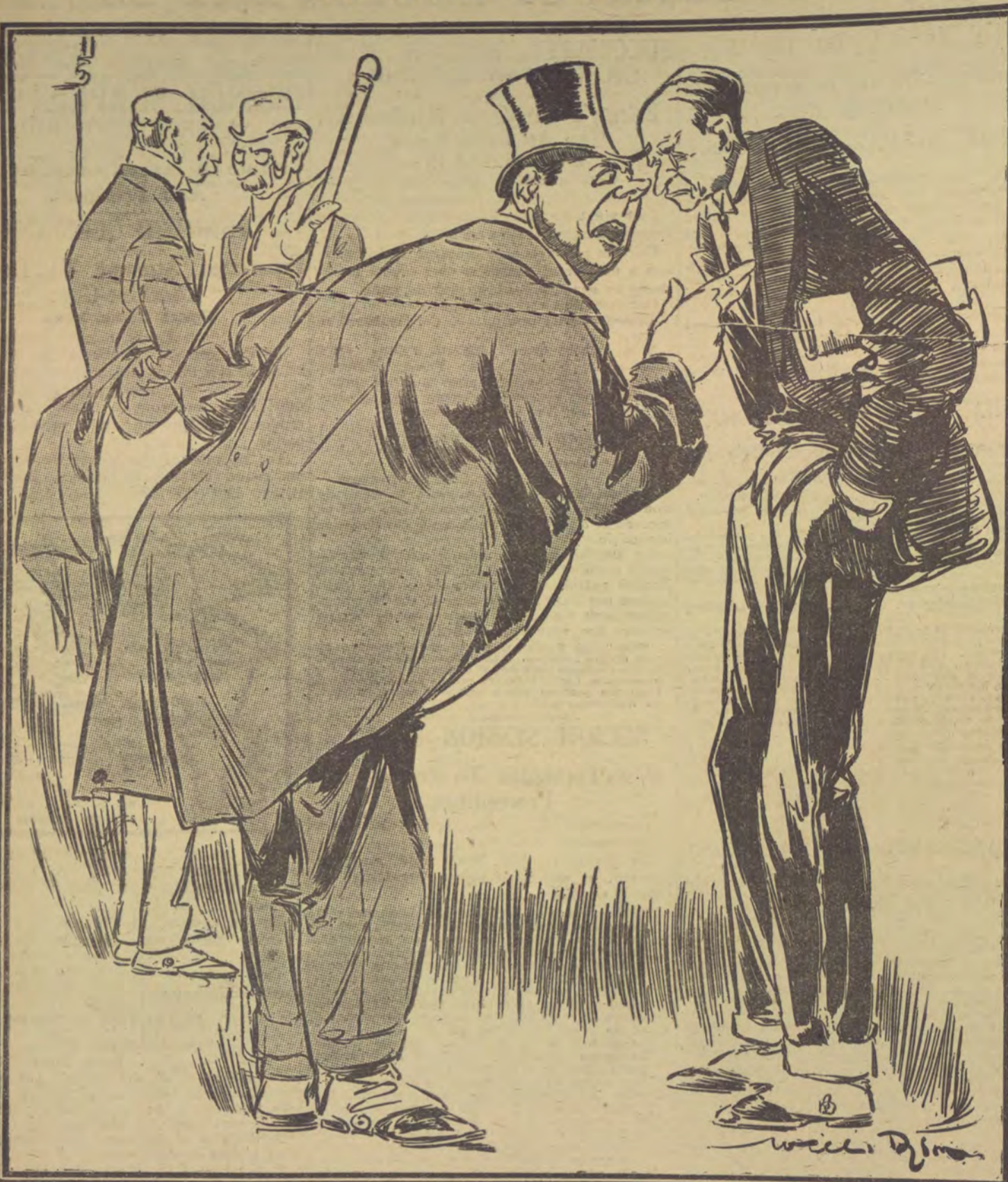
FIRST GINGER PESSIMIST: "It's as plain as a pikestaff, my boy, what's to happen. This poor benighted country is to drift to victory—without me and you being able to get any of the credit for it."

SPLENDID Holiday Reading IN THIS WEEK'S IDEAS