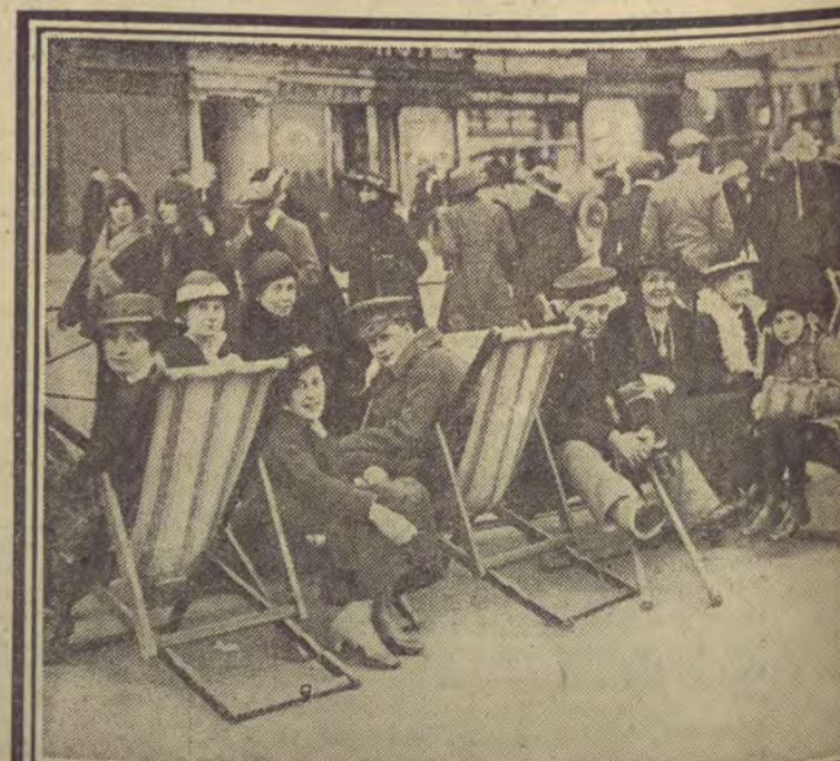
Wounded soldiers and sailors spent the day with their friends on the front at Brighton.