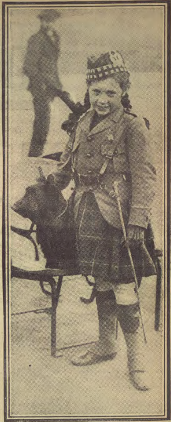
All Scotch. The little lass and her dog spent their Easter at Brighton.