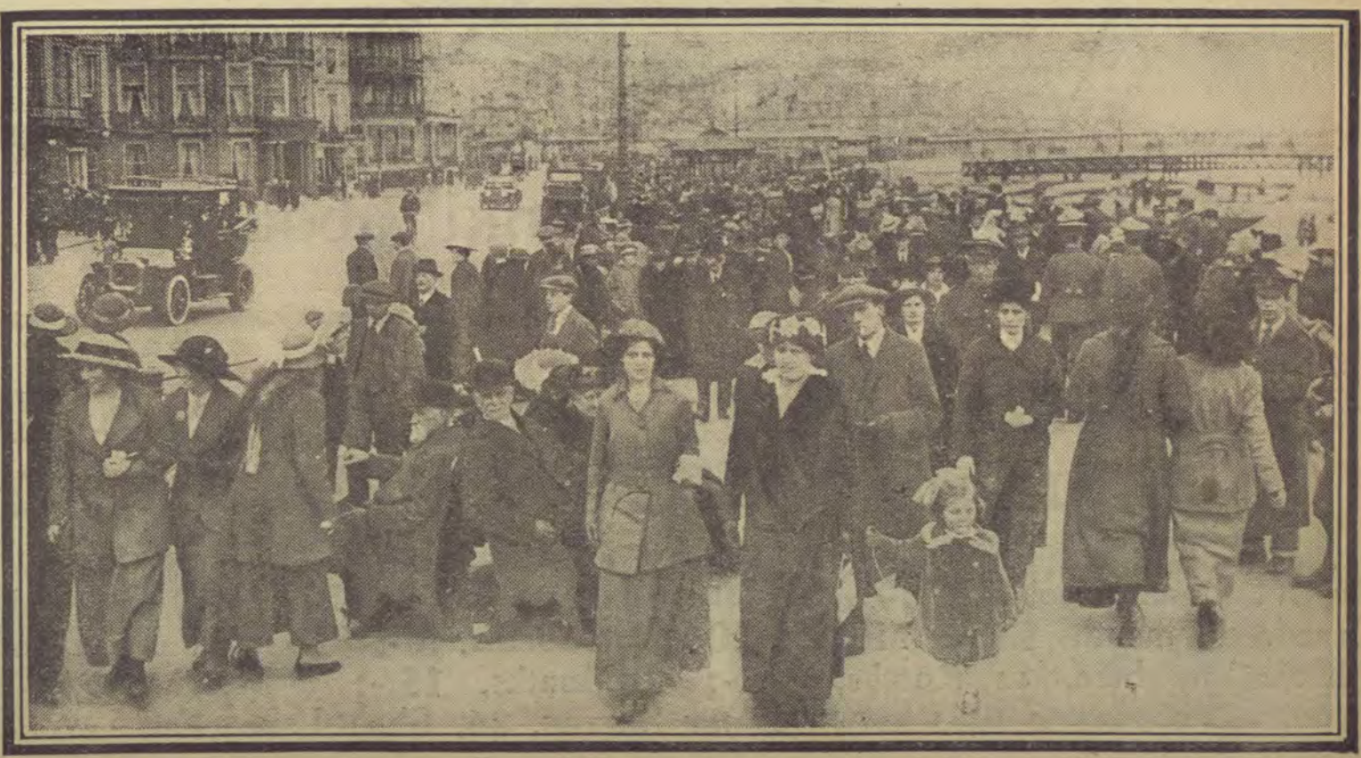
A glimpse of the holiday crowd on the promenade near the Palace Pier, Brighton, yesterday. Munition workers, soldiers in khaki and hospital blue, old people and children, were all there.