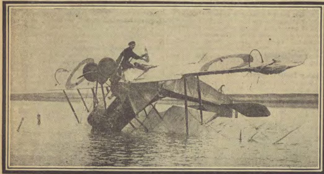
A little mishap to one of our aeroplanes in the Mediterranean. The machine fell into the water upside down. The pilot had a narrow escape, as he had a supply of bombs on board.