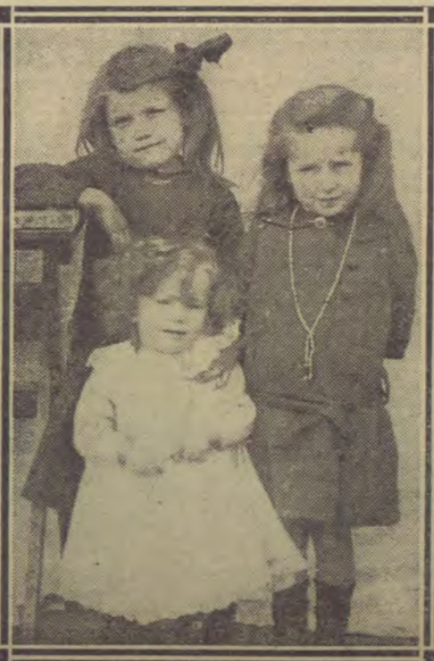
The finder believes this little family group belongs to a member of the Durham Light Infantry.