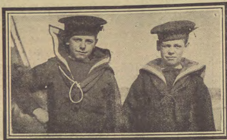
These lads are only fifteen, but they have both been at sea for over a year aboard a patrol boat.