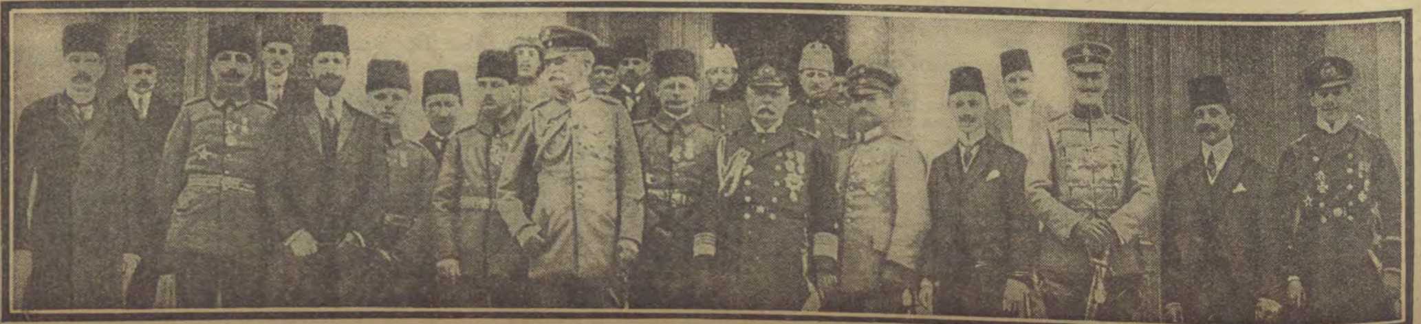
General Mackensen photographed in Constantinople before leaving for Armenia to take control of the operations against the Russians. The success of the Tsar's brave soldiers has put Con-