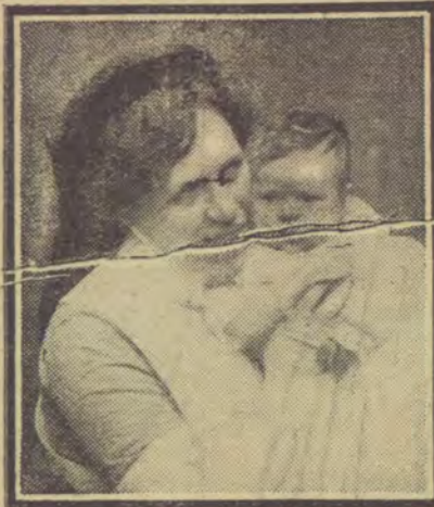
A R.A.M.C. man recovered this on a battlefield in France.