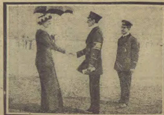
The German Crown Princess offers her congratulations to one of the "heroes" of Hun frightfulness from the air.