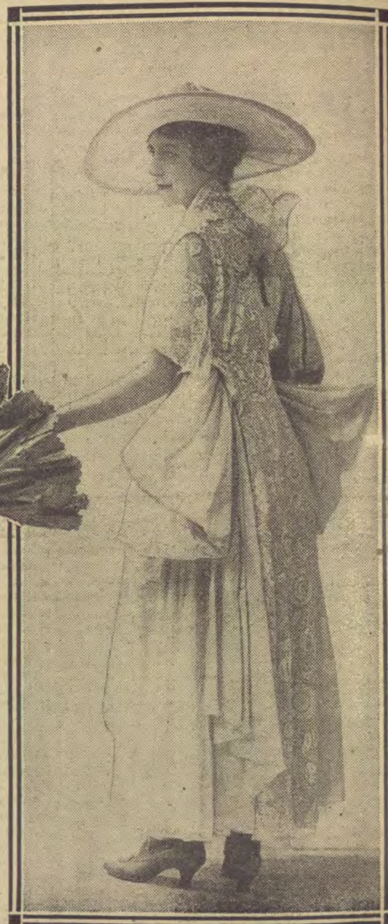
The new wing panniers on a lace gown, and the revived parasol of the seventies.