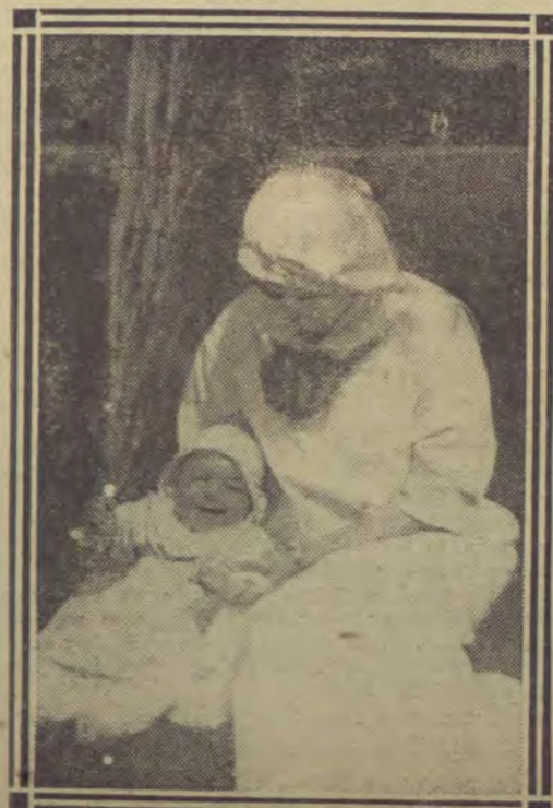
This, with two other snaps, was discovered in an envelope among the ruins of the Cloth Hall, Ypres.