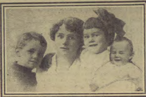
A happy family picture which was picked up on the beach at Cape Helles the day before the evacuation.