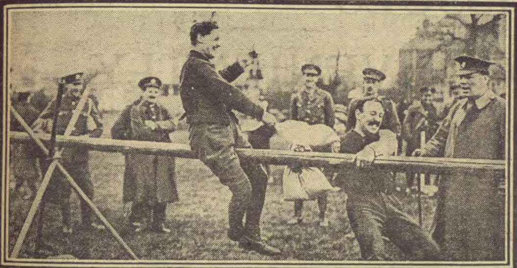
A pillow fight was one of the most amusing features of the sports meeting organised by Army Service Corps men by way of an Easter interlude.