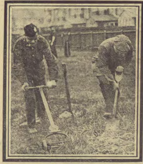
A sergeant of the London Scottish devotes his holiday to preparing a West Ealing allotment for war-time vegetable growing.