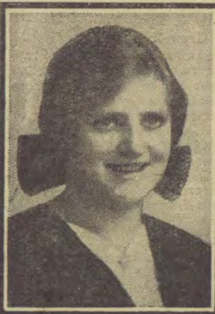
Picked up after a sharp engagement in which the Canadians were concerned.