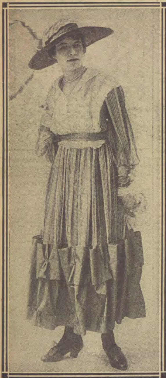
The taffeta flounce and the embroidered lawn corsage distinguish this black and white muslin gown.—(Armand.)