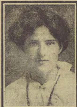
This photograph was taken at Tunbridge Wells and lost in France.