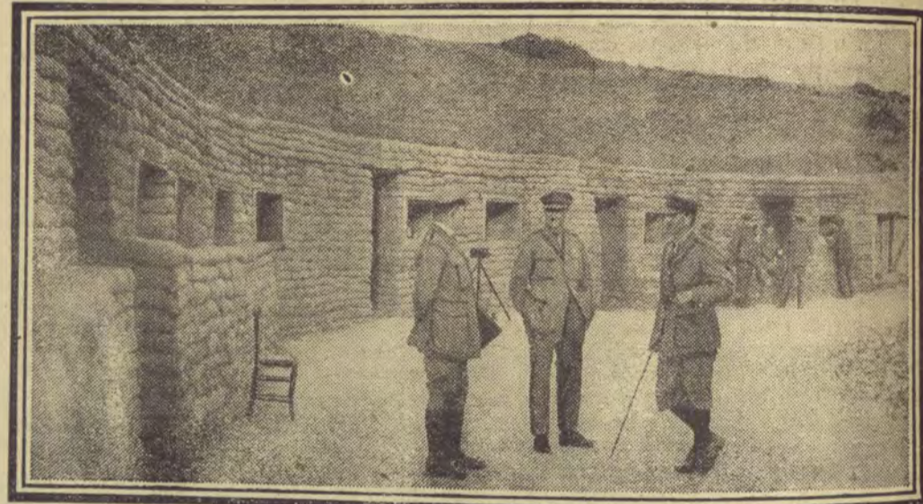
The appearance of Sandbag Terrace, the name by which these divisional headquarters at Salonika are known, is quite suggestive of a row of shelters at some seaside resort.