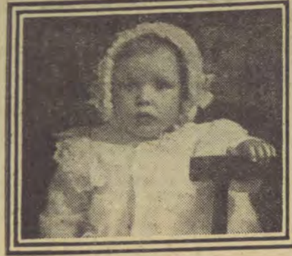
"Somebody's darling," writes the private who found this in Flanders.