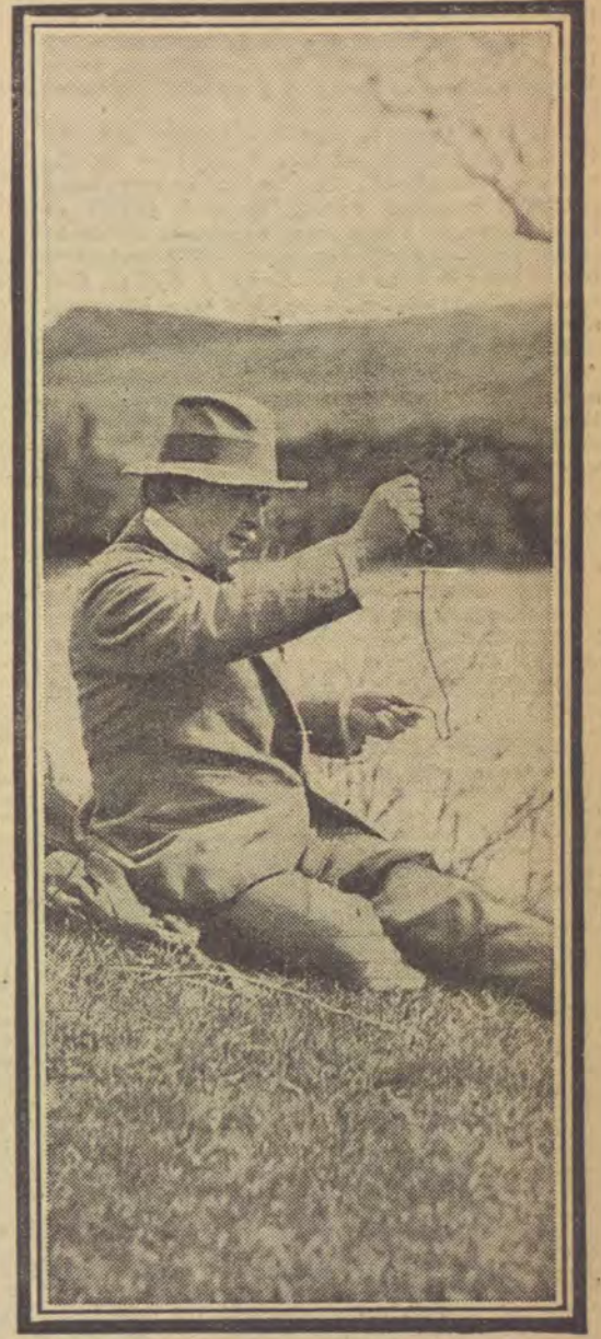
Re-baiting the hook.