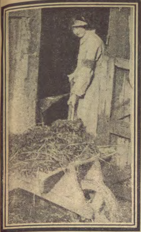
A fair farmhand in Nottinghamshire, proud of her green armlet, sacrifices her Easter holiday to spring-cleaning the cowsheds.