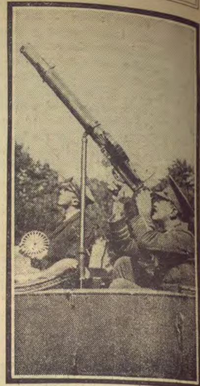
It is an excellent anti-aircraft gun, as the Huns have found out.

The "Hose of Death" is the name our men have given the deadly Lewis machine-gun. The story of this wonderful quick-firer is told on page 10.