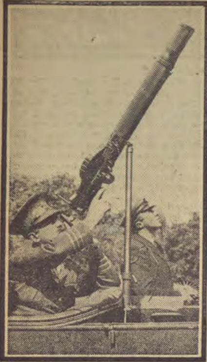
The Lewis gun can be mounted on a motor-car.