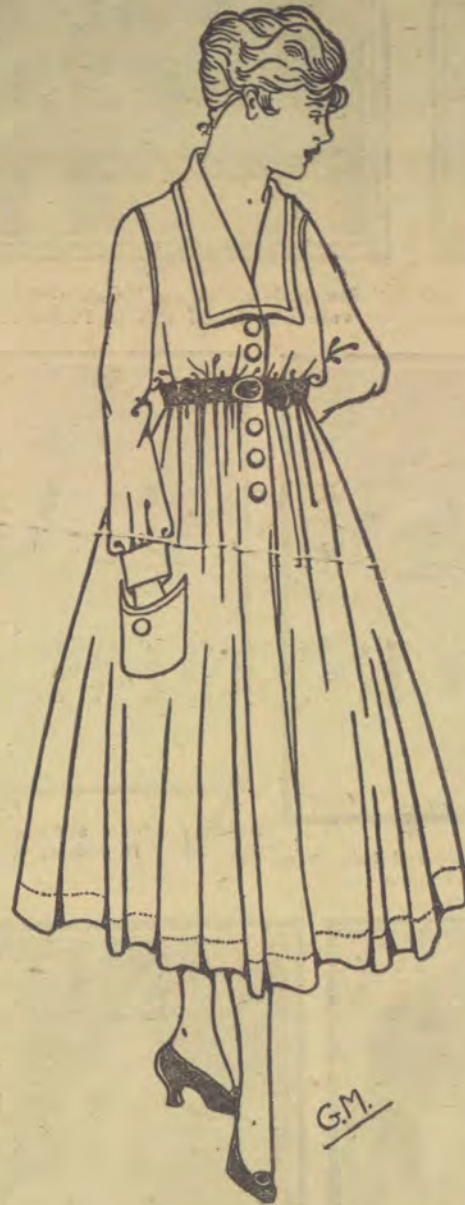
Daily Sketch Pattern 1,026—a washing frock.

Scope for individuality is given by the large buttons. Satsuma buttons, of which many women possess a set, look well with shantung, while coloured buttons to match are effective if linen with a coloured stripe or spot is chosen. If the dressmaker has a quaint set of small buttons she could employ them by setting them on in groups of three.