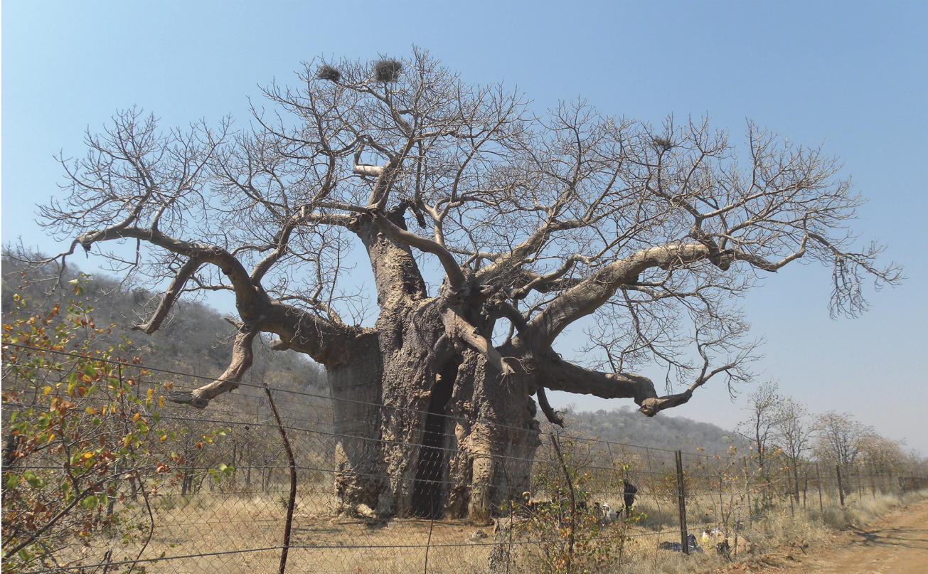
Fig 1. General view of the Lebombo baobab, showing also the high entrance to the cavity. The photograph is taken from the Eco Trail 4x4 of the Kruger National Park. One can observe the fence which marks the border between South Africa and Mozambique.