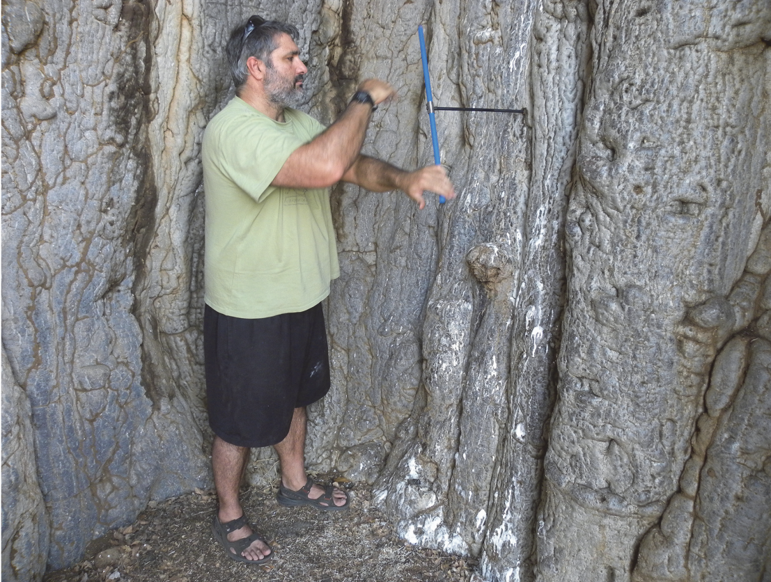
Fig 4. Collecting the oldest sample (Nr. 2) from the false cavity of the Lebombo baobab.