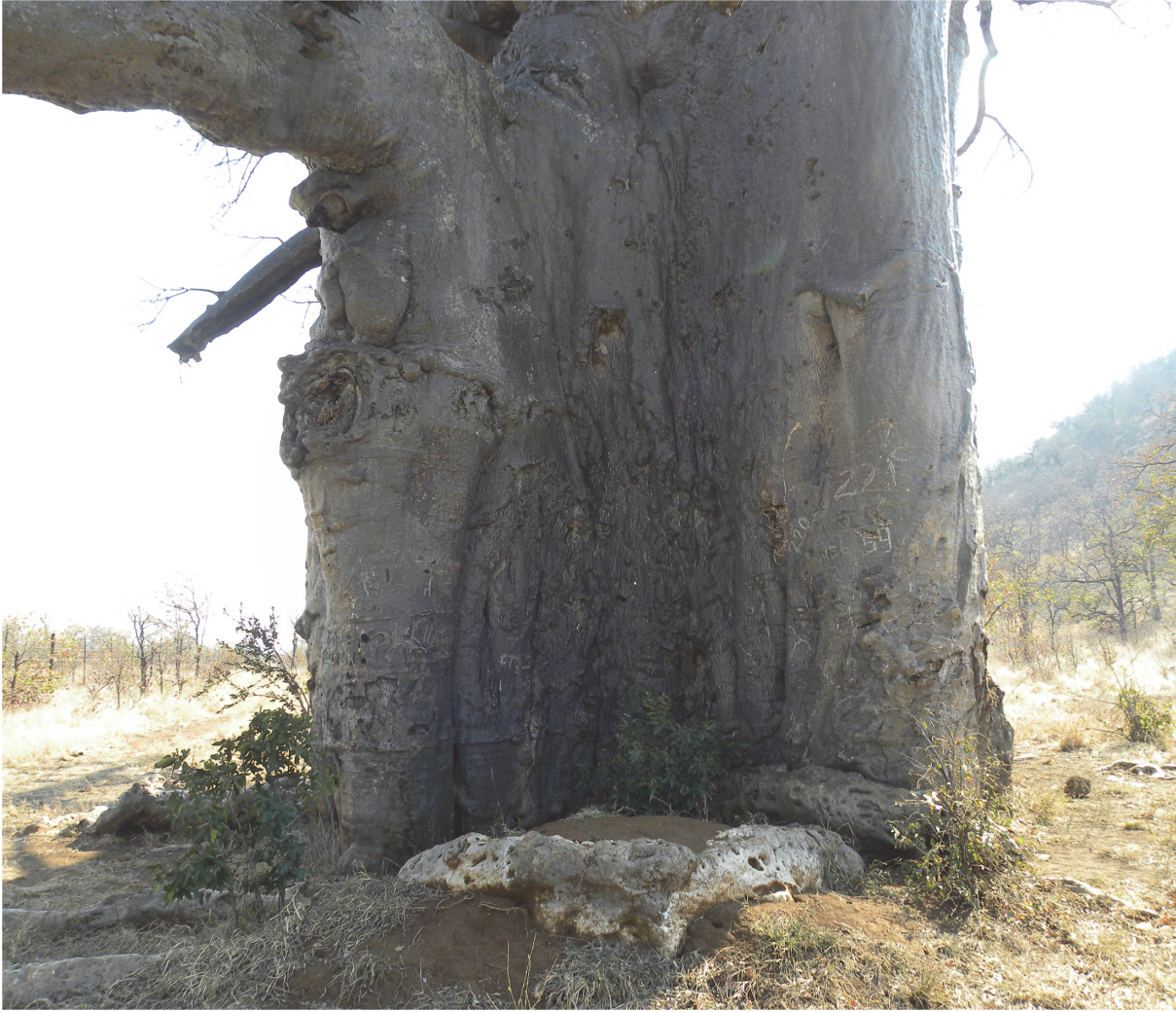
Fig 5. The image shows the relict stem in front of stem III. The pronounced convex shape of stem III indicates that it had to conform to the shape of the older relict stem.