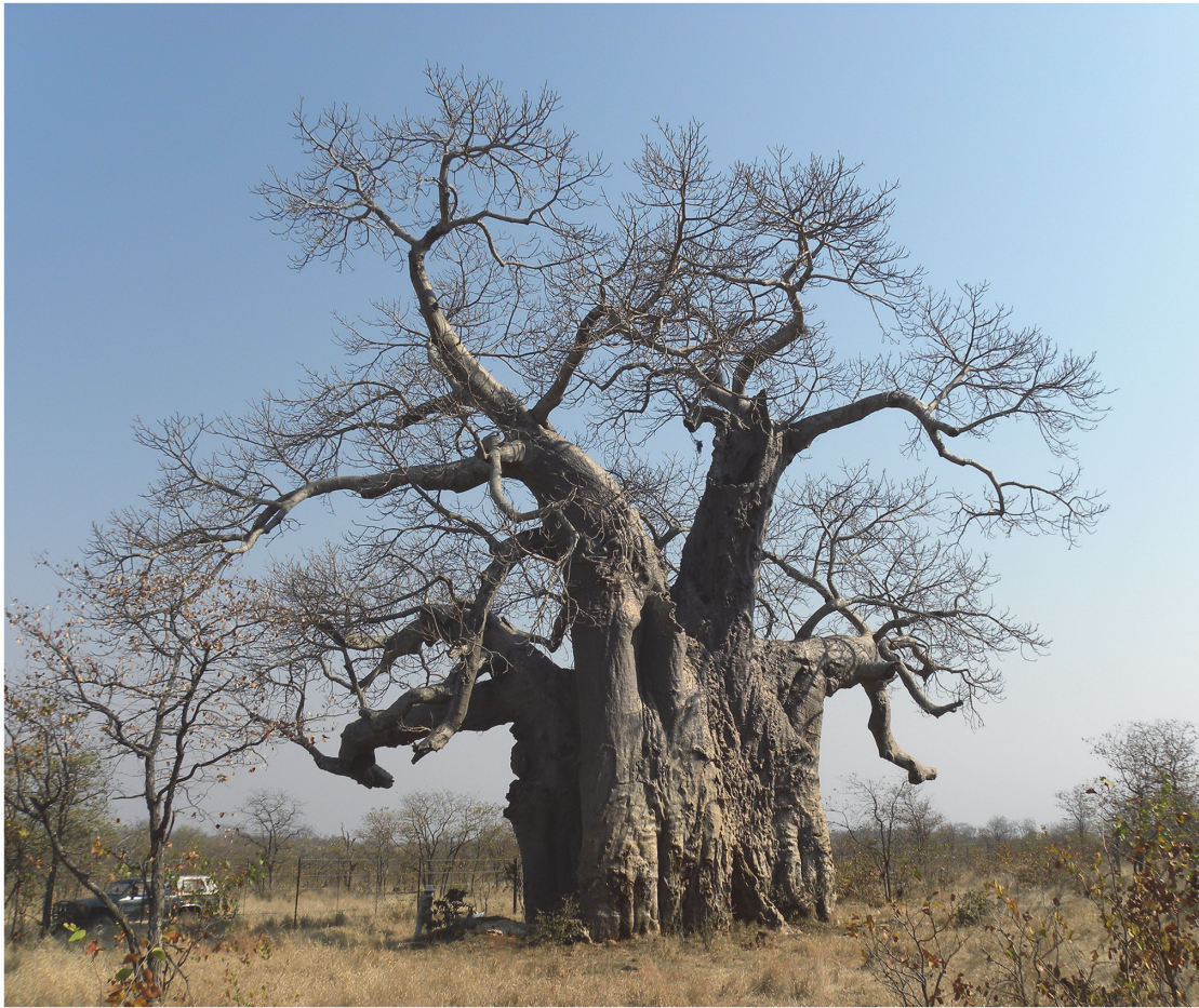
Fig 6. The canopy shape (without any branches toward the south-west) and the very irregular profile of stem IV (in front) suggest that another stem must have collapsed in its vicinity.