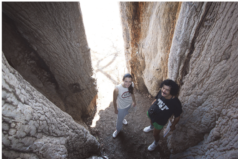
Fig 2. Top view of the tall false inner cavity of Lebombo baobab, which is defined by five fused stems. One can notice the ellipsoidal shape of the cavity base and the bark which covers the cavity walls. The false cavity has a large opening toward the outside. (The photograph was taken by Stephan Woodborne).