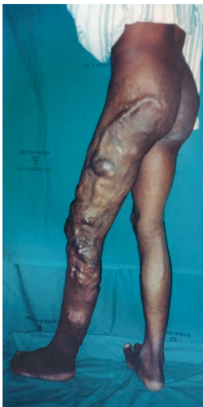
Fig. 1. A patient with severe limb varicosities due to an arteriovenous malformation. These are located superiorly and laterally and not in the vena saphena magna area of distribution. Note also the overgrowth of the affected limb.

The most common cause of occlusion of the major veins in the abdomen is thrombosis. [4] The patients described here presented