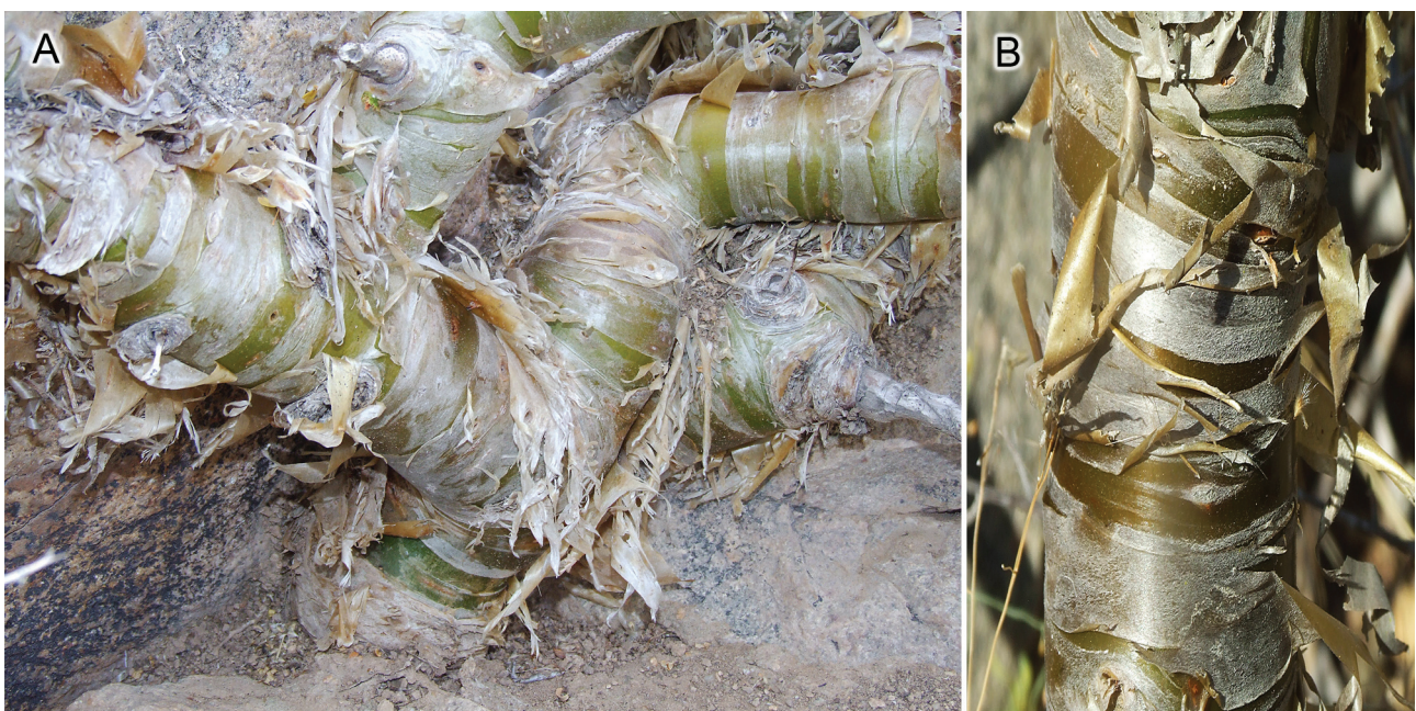
FIGURE 2. Commiphora namibensis . Old stems showing flaky bark. (A) Base of plant with low branching, growing tightly wedged among rocks; (B) trunk.