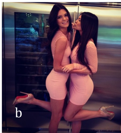
(1a: Eonline, 2010; 1b: Examiner, 2010; 2a: Celebuzz, 2012; 2b: My Daily UK, 2012; 3a: OK! Magazine USA, 2001; 3b: Celeb Baby Laundry, 2012; 4a: Playboy, 2007; 4b: Hey it's Jenna, 2012).