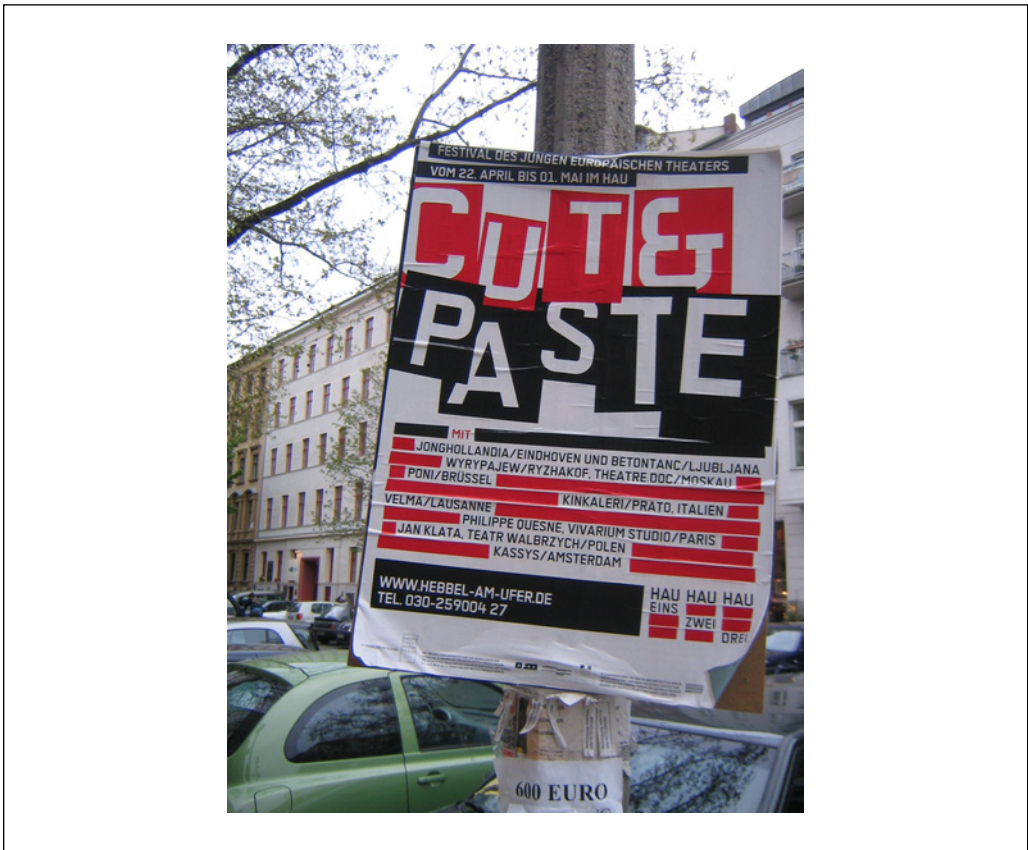
Figure 10.