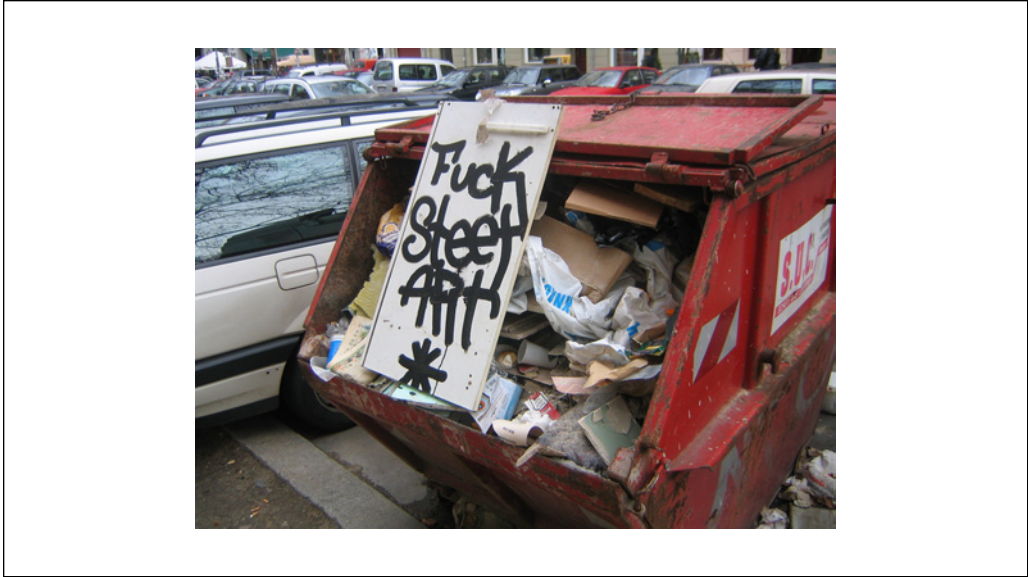
Figure 9.