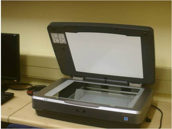
Figure 9: Flatbed Scanner at Institution B