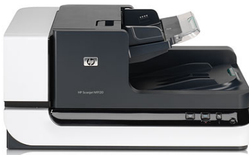
Figure 3: HP Scanjet N9120 Document Flatbed Scanner