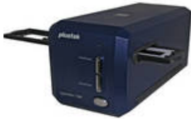
Figure 4: Plustek OpticFilm 7400 Scanner

Peterson (2005) points out that besides flatbed scanners and digital cameras, film scanners are also well suited for handling special materials like heritage materials in a library. Below is an example of a film scanner that can be used in digitising films.