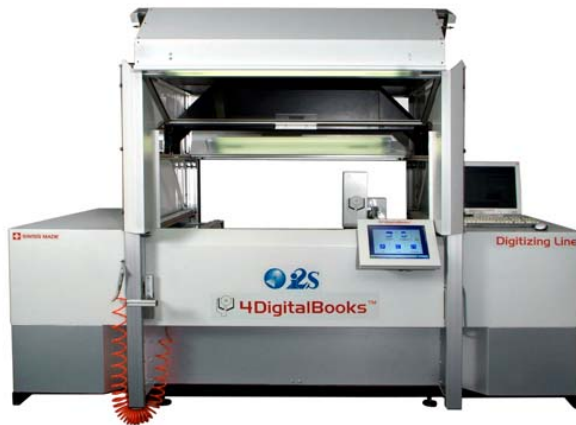
Figure 2: Digitising Line (DL 3000)

“The Digitizing Line is a scanner for bound works that is equipped with an automatic page turning system. DL 3000 scans up to 2500 pages per hour” (i2S Corporate 2012). See image below: