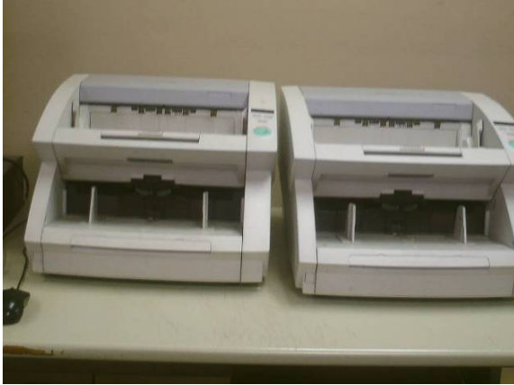
Figure 7: Feeder scanner used at Institution A

scanning unbound materials but they outsource some of their digitisation work that cannot be scanned using flatbed scanners (for instance books and oversized materials). The researcher was given the opportunity to digitally record, (take photographs of) the scanners that are used in the institutions that were studied. The images below show some of the scanners that are used in the institutions that were studied.