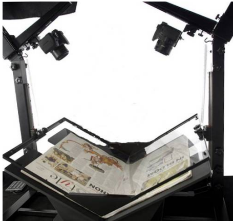
Figure 13: Book Drive DIY scanner at Institution A

Apart from flatbed scanners and book scanners, the study also found out that film scanners are also needed to digitise microfilm and slides. Among the five institutions that were studied Institution D had film scanners used for this purpose. The image below (Figure 14) shows the film scanner found at Institution D.