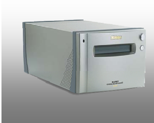
Figure 14: Nikon Film scanner at Institution D

Apart from flatbed scanners and book scanners, the study also found out that film scanners are also needed to digitise microfilm and slides. Among the five institutions that were studied Institution D had film scanners used for this purpose. The image below (Figure 14) shows the film scanner found at Institution D.