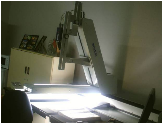
Figure 12: Suprascan 10 000 scanner at Institution D

Institution D has a Suprascan 10 000 scanner that uses camera technology. The scanner has a mounted overhead camera that is capable of scanning bound books of different sizes up to size A1. Figure 12 below shows the Suprascan 10 000 scanner.