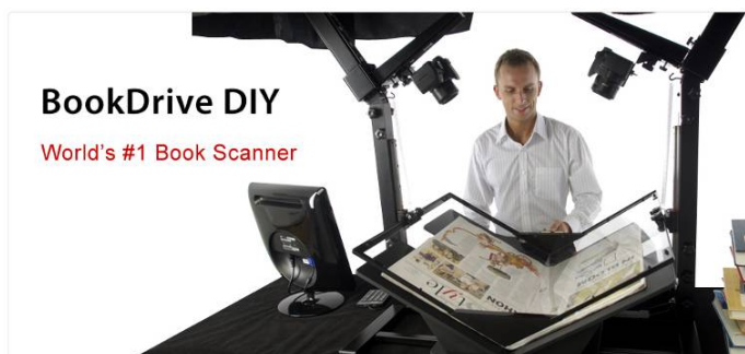
Figure 1: Bookdrive DIY

Liu (2004) observes that there is a trend toward using mounted digital camera rather than flatbed scanners as more attention is now being given to the reliability of equipment and software. Peterson (2005) advises that selecting an appropriate scanning device is very important in the digitisation process. The BookDrive DIY book scanner shown below is an example of scanning equipment that makes use of digital camera.