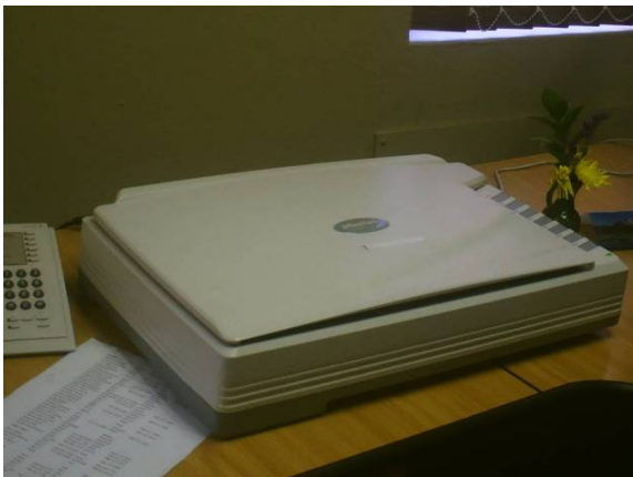
Figure 8: Flatbed Scanner at Institution A

The feeder scanner shown in Figure 7 is used at Institution A to scan materials that are unbound. The scanner can scan up to A4 size paper. This type of scanner is relatively faster than flatbed scanners because it takes in loose papers automatically from the feeding tray.