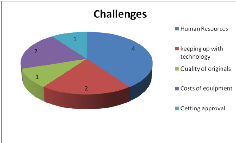
Figure 15: Challenges in digitisation