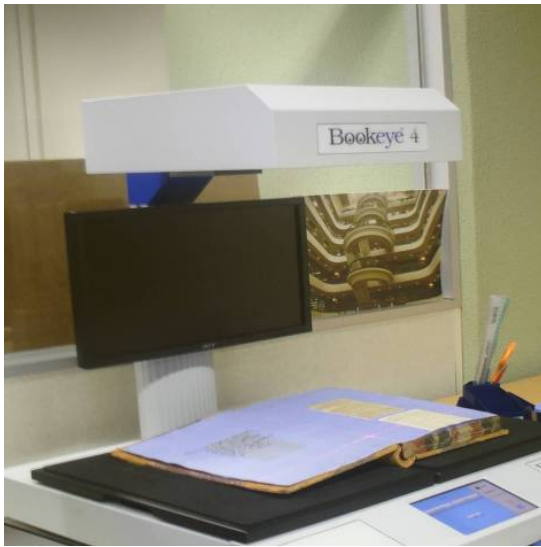
Figure 11: Bookeye 4 Scanner at Institution E

Institution D has a Suprascan 10 000 scanner that uses camera technology. The scanner has a mounted overhead camera that is capable of scanning bound books of different sizes up to size A1. Figure 12 below shows the Suprascan 10 000 scanner.