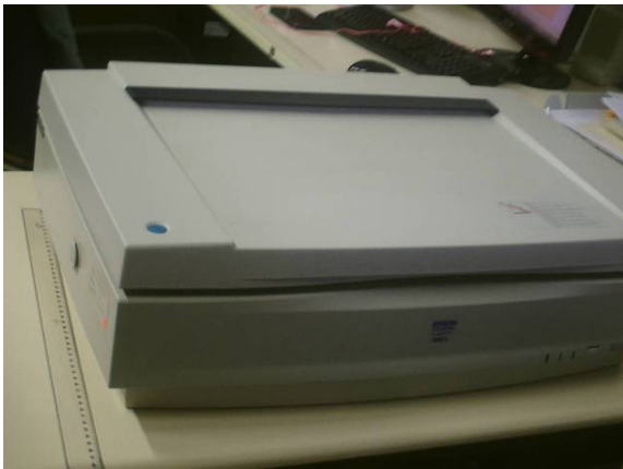
Figure 10: Flatbed Scanner at Institution D

The flatbed scanners in Figure 8; Figure 9 and Figure 10 are used to scan unbound materials. The scanners are capable of scanning basically the same type of materials. The difference is that they are manufactured by different manufacturers. Institutions have different preferences hence the differences in the brands of the flatbed scanners in the institutions studied. The prices of the scanners also differ so institutions choose the brand that suits their budget.