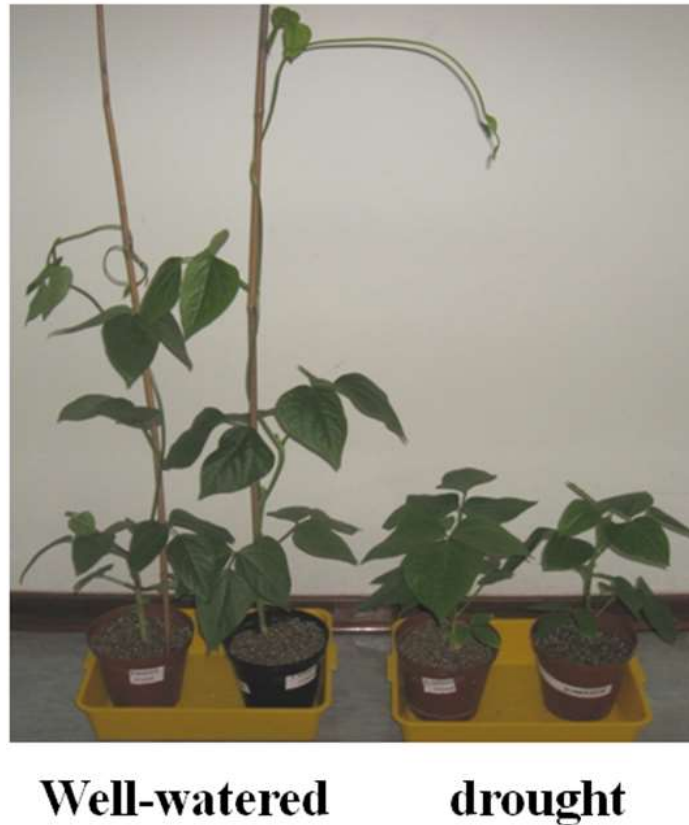
Figure 1: Cowpea landraces after third foliar stage plants were maintained for two weeks under well-watered conditions or exposed for 2 weeks to drought conditions by withholding water.

individual landraces, drought treated Timbawene moteado had higher leaf and root dry biomass as well as higher leaf and nodule protein content (Figures 2 and 3). At the same time this landrace had also the highest nodule biomass and nodule number and significantly ( P < 0.05 ) higher SNF under drought (Table 1). In contrast, Massava nhassenje had the lowest biomass (leaf and root) and also protein content (leaf and nodule) (Figures 2 and 3) as well as the lowest nodule biomass and SNF, together with Namarua, and a significantly ( p \leq 0.05 ) lower nodule number when compared to all other landraces (Table 1).