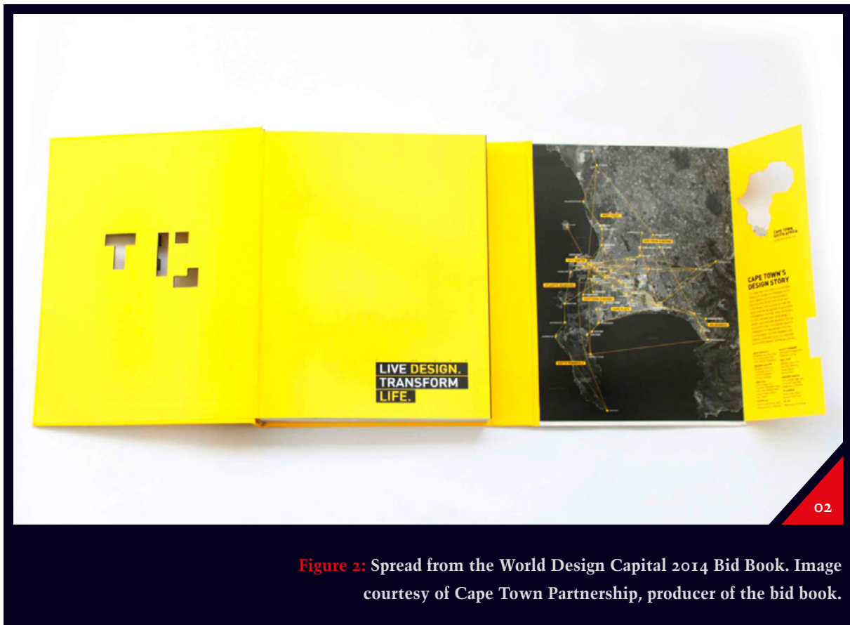
Figure 2: Spread from the World Design Capital 2014 Bid Book.

The continuing social and economic inequalities, and consequently the urban disparities in the city, hinder inhabitants' equal rights in and to the city. Reference to the city here is not restricted to the inner city, but extends to the greater Cape Town area as well. Furthermore, the increasing population growth as mentioned above also contributes to the challenges faced by many communities, and puts a strain on access to basic services. In an opinion piece by Tristan Gorgens (2012) in the online, South African Design>Magazine , he asserts that '[e]lection after election, "democracy" ends the moment the last vote is cast – all that follows are empty references to "consultation" and desperate running battles over basic services.'