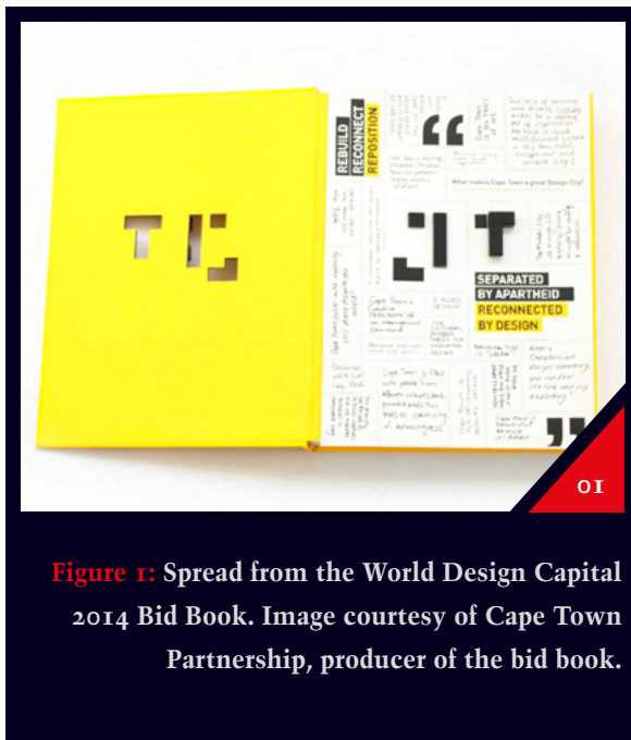
Figure 1: Spread from the World Design Capital 2014 Bid Book.

The World Design Capital is a city promotion initiative or designation that began in 2008. The designation is awarded biennially, by the non-profit organisation, the International Council for Societies of Industrial Design (more commonly referred to as Icsid), to cities that use design and creativity for social, economic and cultural development. The organisation links national, professional associations and serves as a unified voice to protect and promote the industrial design discipline. Although industrial design holds its own as a discipline, owing to the multi-disciplinary nature of design practice, the World Design Capital initiative is not limited to industrial design. Nonetheless, the initial concept was introduced specifically to the Icsid Executive Board with the intention to motivate cities to recognise and use design as a strategic development tool. From conceptualisation, it was hoped that the initiative would garner interest and support from global design networks and especially governments to consider the value of design for economic and social growth. Furthermore, the intention was for the initiative to encourage dialogue about the ‘impact of design on quality of life’ of inhabitants in the