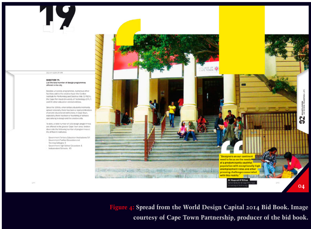
Figure 4: Spread from the World Design Capital 2014 Bid Book.

way of thinking. This difference is highlighted by Charles Owen (2005:5), who states that 'where the scientist sifts facts to discover patterns and insights, the designer invents new patterns and concepts to address facts and possibilities.'