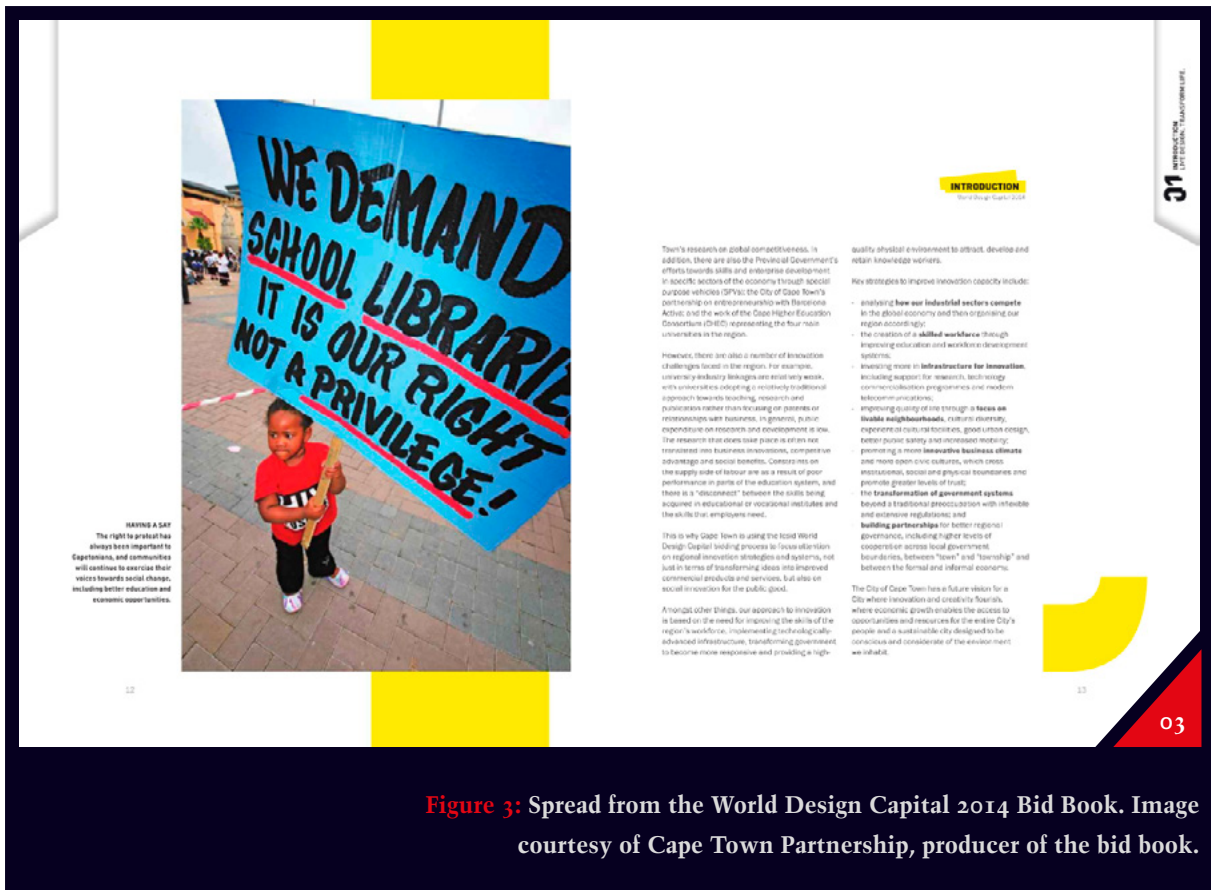
Figure 3: Spread from the World Design Capital 2014 Bid Book.

adopts the idea of design as a conversation, and thereby his sentiments echo Donald Schön's (1983:78) concept of design as a reflective conversation where both the design problem and solution are bound by an iterative process animated by a variety of stakeholders, including the end-users of the designed outcome. Most design disciplines today are evolving to become more participatory in nature, and not only are designer's roles changing, but consumers are changing as well. Elizabeth Sanders (2006) supports this by noting that '[t]he everyday people we serve through design are becoming proactive in their demand for creative ways of living.' People are realising their potential to become active participants, and creativity provides common ground amongst them to take action. While reflecting on a human-centred framework of design, Richard Buchanan (2001) repeatedly asserts that design can be regarded as 'a discipline of collective forethought.' The involvement of end-users