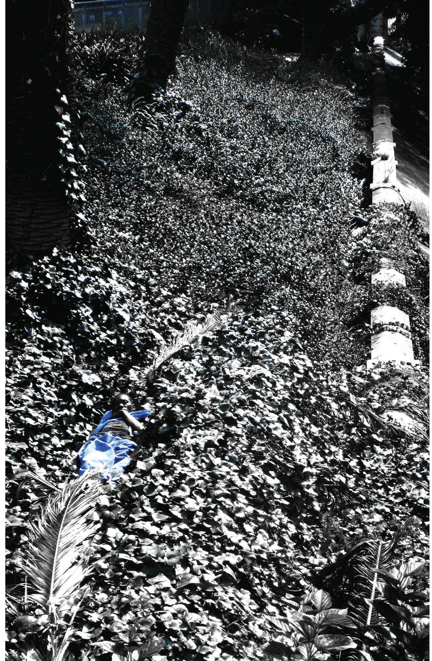
Figure 2.8. (opposite) A man lying in shrubbery along the canalized Apies river. This is a result of the lack of inclusive environments that exist within the city (Author 2010)