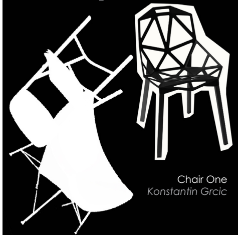
Chair One Konstantin Grcic