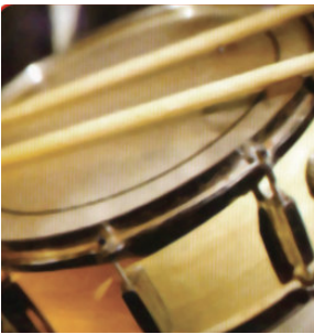
fig. 1.1 : Elements synonymous with the Department of Music and the process of music - preparation and performance.