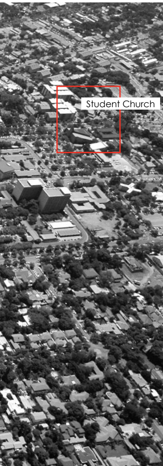
fig. 1.2 : An aerial photograph of part of Hatfield Campus and the surrounding urban fabric. Current venues in service of the Department of Music are indicated to illustrate the segregation of the Department and its facilities.

In general, the Department requires the upgrading of existing facilities and the establishment of new facilities that will align them with their counterparts, as well as provide an image that will portray the Department's contemporary dynamics.