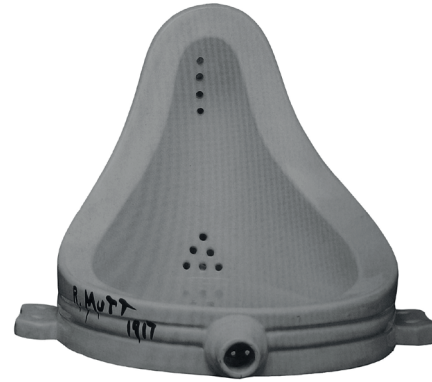
Fig. 1.2. Marcel DuChamp's Fountain (1917) Ready-made. (Phaidon, 2000: 142)