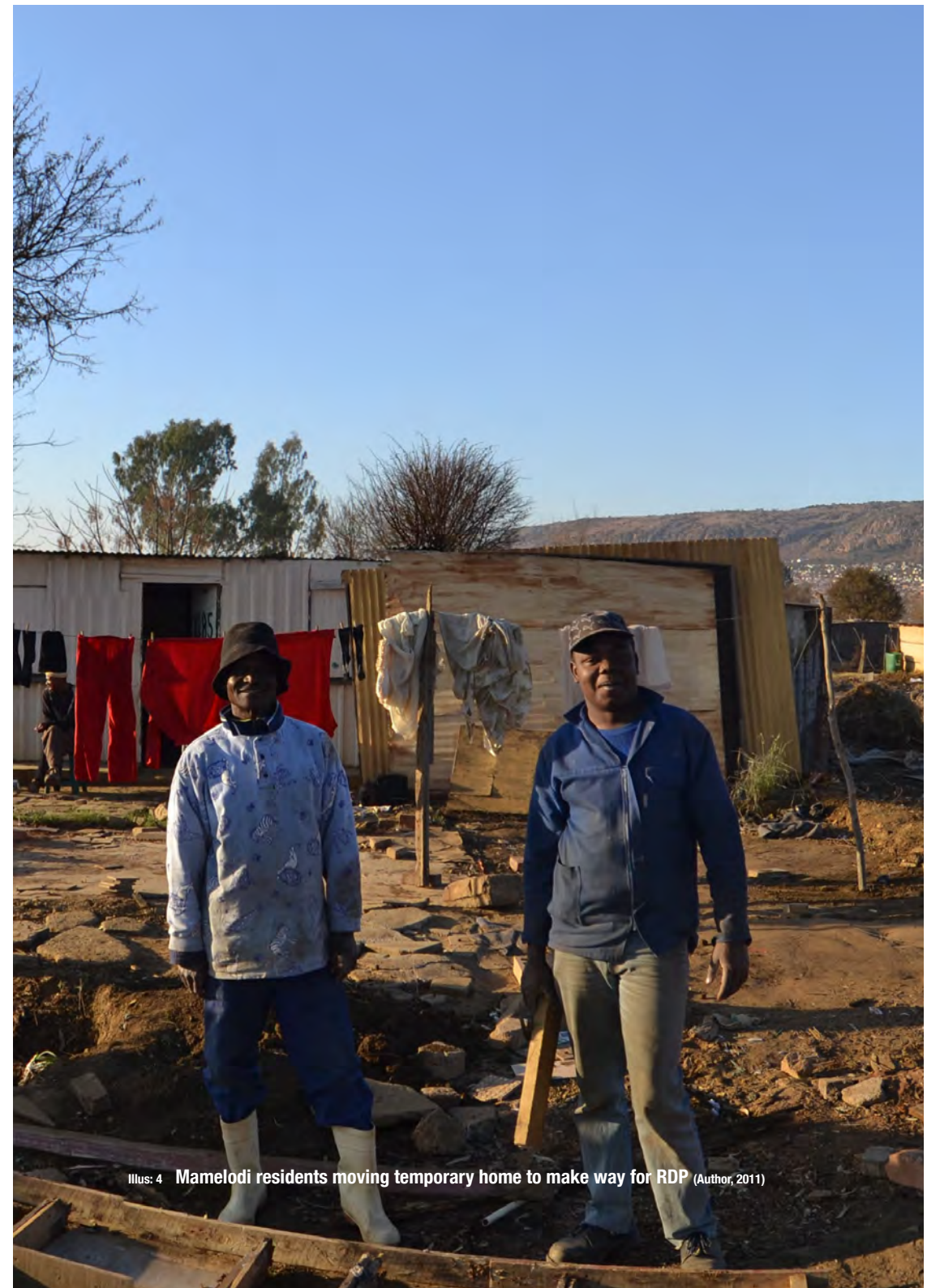
Illus: 4 Mamelodi residents moving temporary home to make way for RDP (Author, 2011)

An alternative set of parameters that define a brief is needed to break this paradigm.