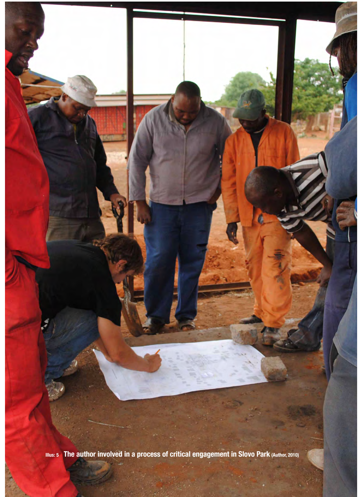
Illus: 5 The author involved in a process of critical engagement in Slovo Park (Author, 2010)

This term, stemming from John Habraken's 1972 publication of Supports: An Alternative to Housing in London , outlines a strong conceptual notion embracing participatory and systematic processes of design and construction that is currently one of the more appropriate techniques with regard to critical engagement with developing contexts. (see Illus: 6)