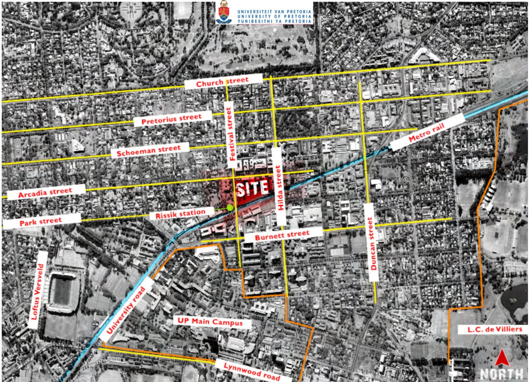
fig5- Orientation map