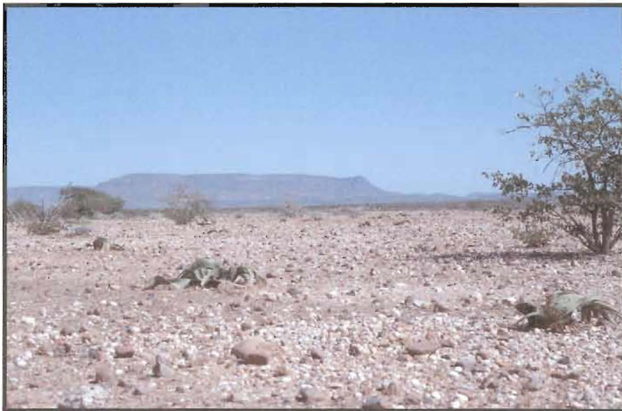
Figure 4 One of the most spectacular combinations: Colophospermum mopane and Welwitschia mirabilis in the Namibian desert.