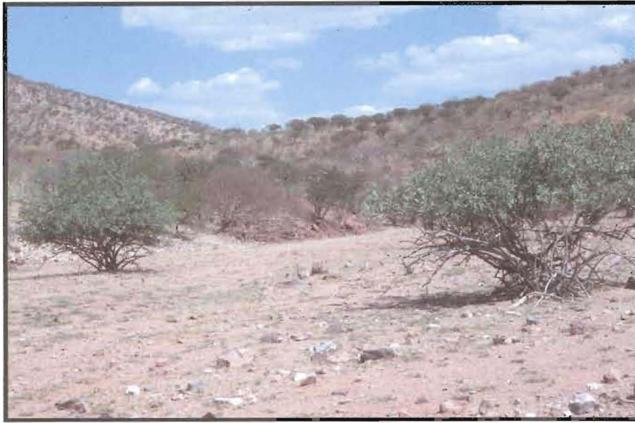
Figure 3 Colophospermum mopane often inhabits dry washes in the arid Kaokoland.