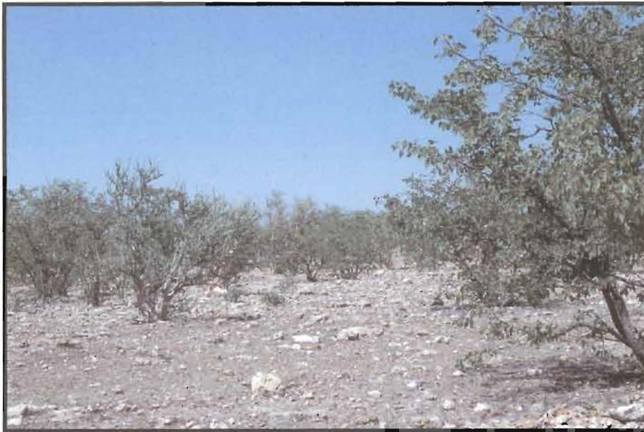
Figure 5 Shallow, calcareous soils in Namibian Mopaneveld.