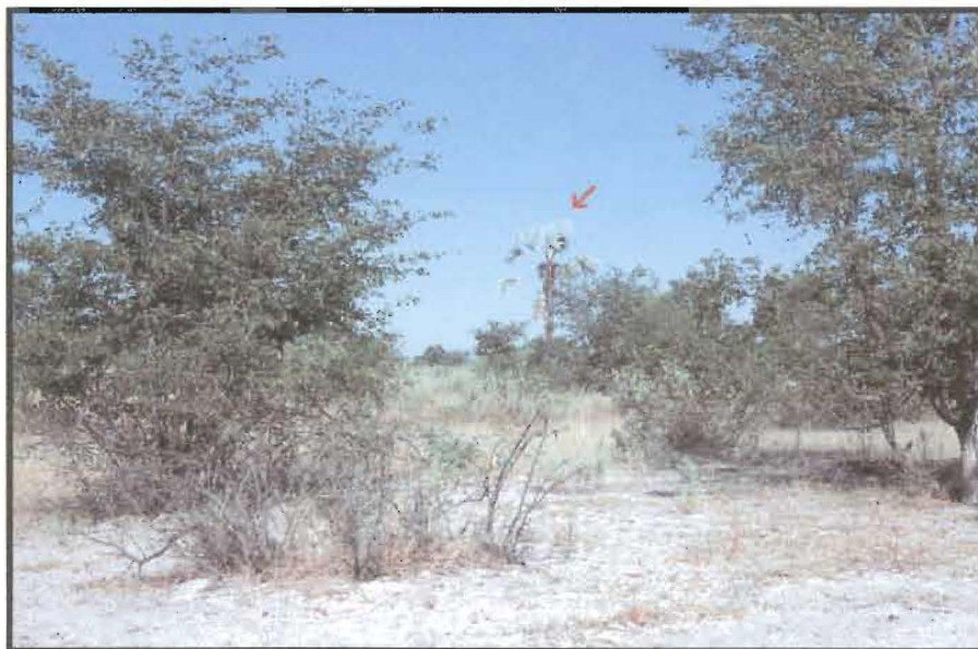
Figure 9 Hyphaene petersiana (arrow) is a common associate of Colophospermum mopane in Owamboland, Namibia.