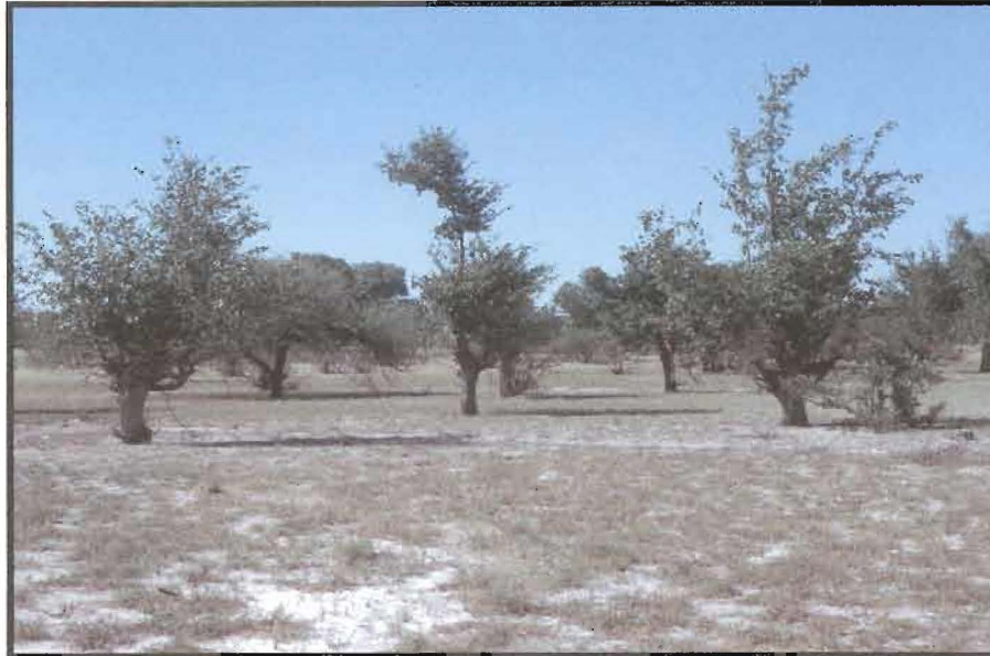
Figure 8 Wood harvesting has a pronounced effect on the structure of Colophospermum mopane trees in Owamboland, Namibia.