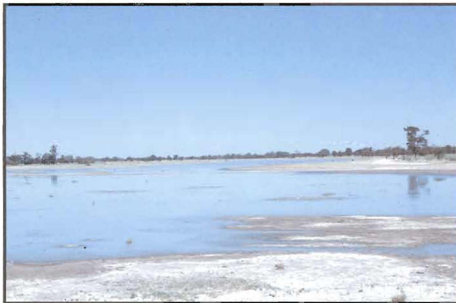
Figure 7 Oshanas in Owamboland. Mopaneveld occurs on the interfaces within the flooded areas.

type, C. mopane occurs with tree species which are usually not associates of mopane, e.g. Burkea africana , Erythrophleum africanum , Terminalia sericea and Combretum collinum (Mendelsohn & Roberts 1997).