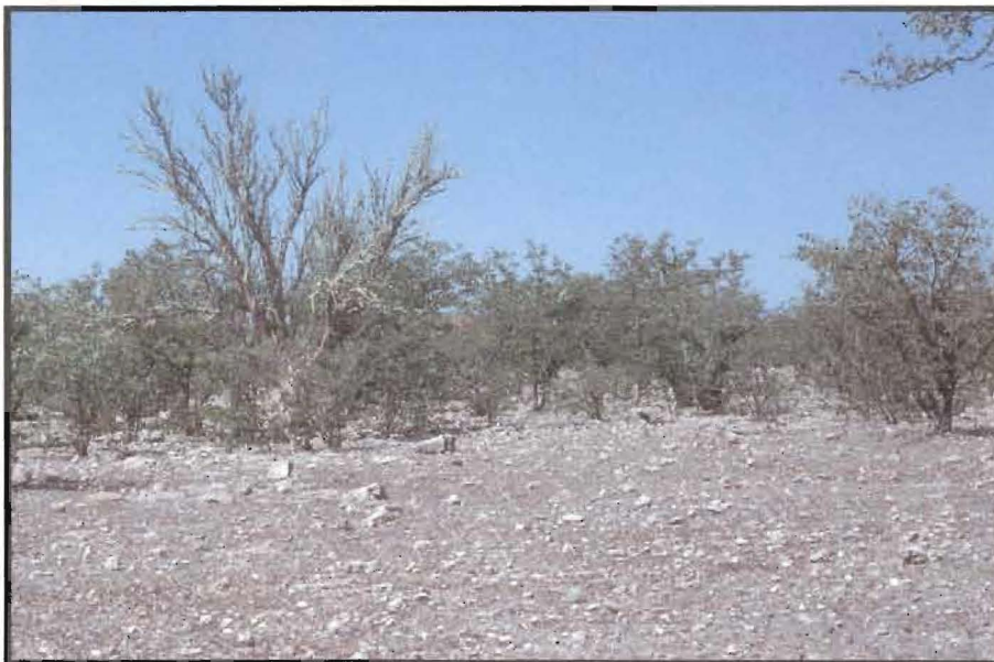
Figure 6 Sesamothamnus guierichii in a Colophospermum mopane community on calcareous soils.