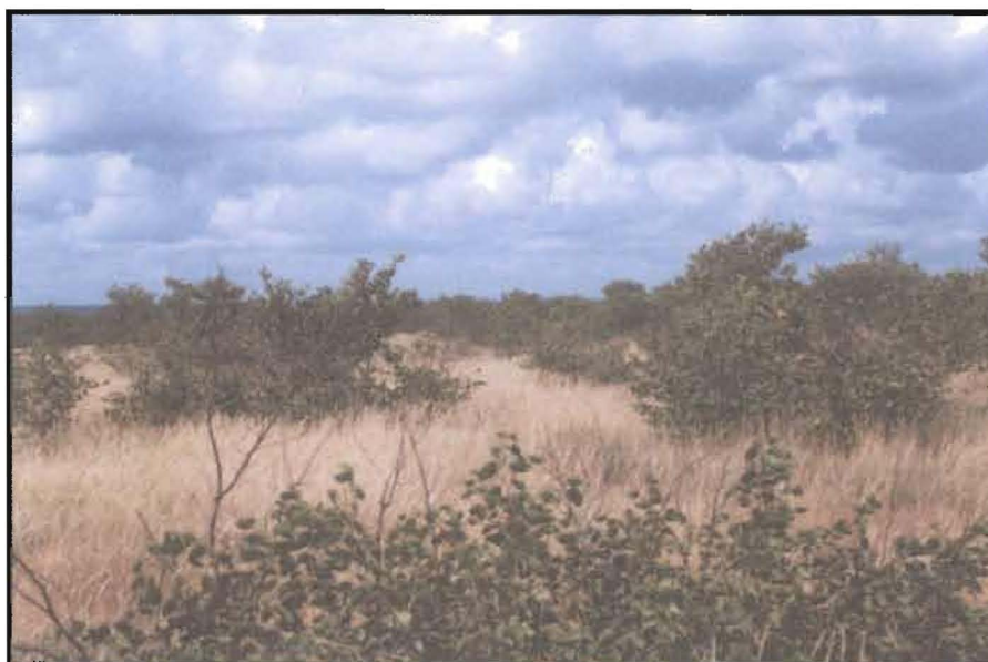
Figure 2 The different growth forms of Colophospermum mopane : (a) high trees of 5–12 m in height (b) high mopane shrubs and (c) multi-stemmed bushy shrubs.