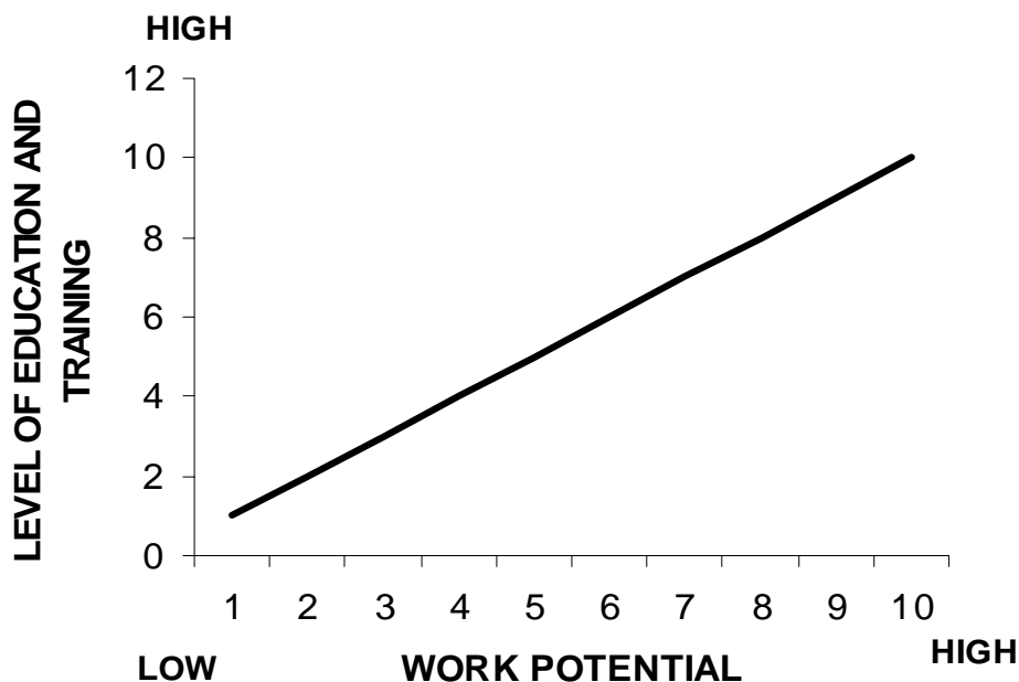
Figure 3.2: Level of education as a determinant of ability

Meager, Bates, Dench, Honey & Williams (1998:3) state that there is a strong link between education and qualification level, and whether a disabled person is economically active. Figure 3.2 depicts the relationship between the level of education and training and work potential.