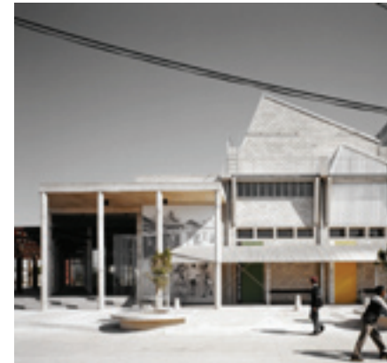
Fig 1.4 Red Location Museum, Port Elizabeth Noero Wolff Architects, 2006 (sammlung, 2011)

Bakker and Muller (2010: [5]) support the argument for an increased “emphasis on intangible heritage as an agent in the production of places of commemoration” as well as an integral part of “community identity formation” and that heritage practitioners should “transform their practice” (Bakker & Muller, 2010 : [5]) in order to better engage with the complex, evolutionary nature of intangible heritage.