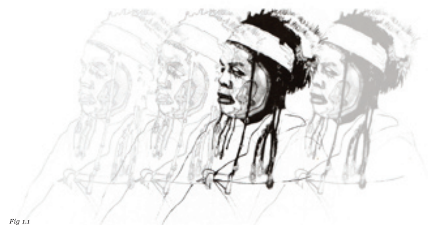
Fig 1.1 The evolution of identity Author

Kirshenblatt-Gimblett ( ibid ) posits that the process of continuous re-interpretation, decoding, adaptation and the adding of additional layers of meaning allows “the outmoded” a life in the present as “an exhibition of itself,” a process she calls Metacultural Production. Metacultural Production and Bakker’s studies on socially constructed heritage meaning form the theoretical backbone upon which the dissertation will explore an architecture that may better engage with the complex, processual nature of intangible heritage.