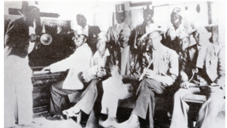
Fig 1. 10 The Merry Blackbirds - 1930's Jazz troupe. (Ballantine, 1993: 53)

Programmatic precedents will be investigated to gain knowledge on the subject of contemporary theatre design.