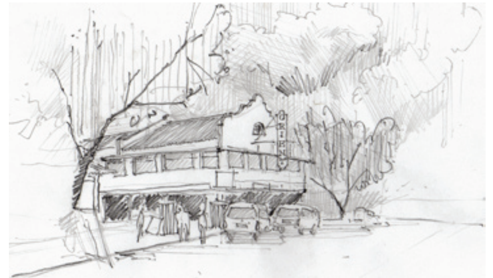
Fig 1.13 Field Sketch: The Orient Theatre today, currently a shebeen and shops, to be restored to a cinema. Author