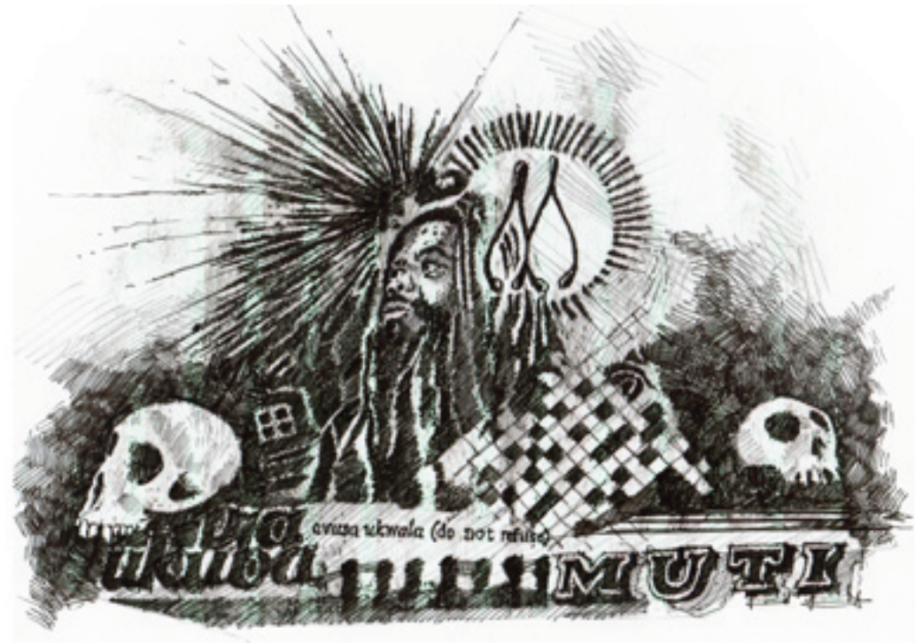
Fig 1.2 The Folklorist Author

The 2001 report defines Intangible Heritage as: “all forms of traditional and popular folk culture, i.e. collective works originating in a given community and based on tradition. These creations are transmitted orally or by gesture, and are modified over a period of time through a process of collective recreation. They include oral traditions, customs, languages, music, dance, rituals, festivities, traditional medicine and pharmacopoeia, the culinary arts and all kinds of special skills connected with the material aspects of culture, such as tools and the habitat” (UNESCO, 2001: 6).