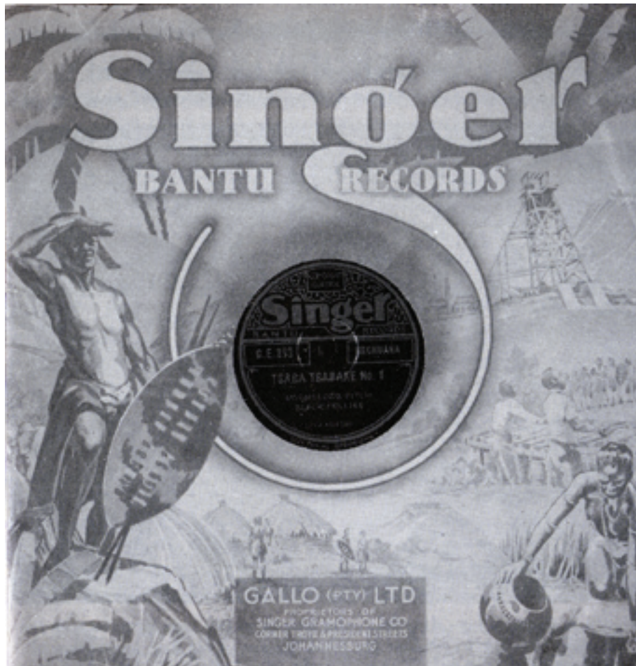
Fig 1.14 Early Gallo Records Album Cover Tsaba Tsabane No 1. (Ballantine, 1998: 54)