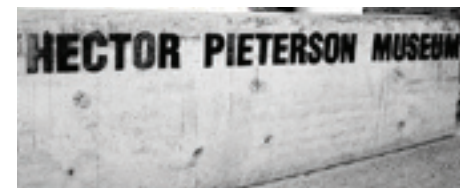
Fig 1.9 Hector Pieterse Museum, Soweto Mashabane Rose Architects, 2002 (flickr, 2011)