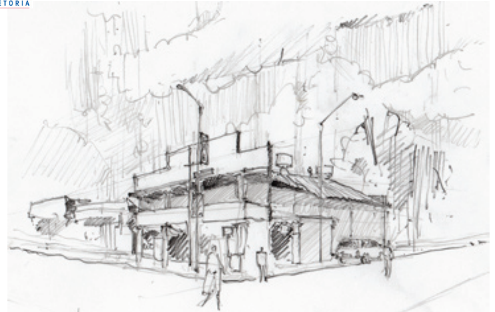
Fig 1.12 Field Sketch: The Empire Theatre today, currently shops but to be reprogrammed as a micro-brewery that brews local historical beers. Author