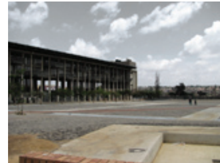
Fig 1.6 Walter Sisulu Square, Soweto StudioMAS, 2005 Author