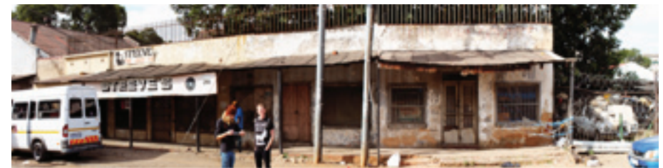
Fig 1.11 Steeve the Jazz King's Records: Historical Remnant of the Marabi era. To be re-programmed as a public sound archive where sounds from the New Royal Theatre are made available to the public. Author