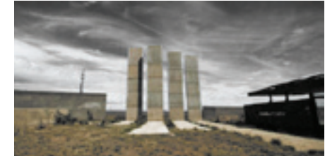
Fig 1.5 Cradock Four Memorial, Cradock GP Greeff and Associates, 2010 Author