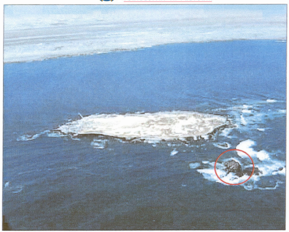
Figure 1.2. Aerial photograph of Ichaboe Island, showing the proximity of the island to the mainland (c. 1.4 km) and the position of the seal colony at Little Ichaboe (red circle), which lies 200 m south-west of the island. The picture is orientated with north to the left.

The Cape fur seal ( Arctocephalus pusillus pusillus , Otariidae; Harrison & King, 1980; Shaughnessy 1979) is the only indigenous breeding pinniped in southern Africa, and is sexually dimorphic for size (Shaughnessy 1985). It breeds at 24 colonies between Cape Cross in Namibia and Algoa Bay in South Africa, with 65% of the population occurring in Namibia (David 1987; Miller, Oosthuizen & Wickens 1996). Population numbers of Cape fur seals have increased since their over-exploitation in the early 1900s (Shaughnessy 1985) and numbered about 1.5-2 million