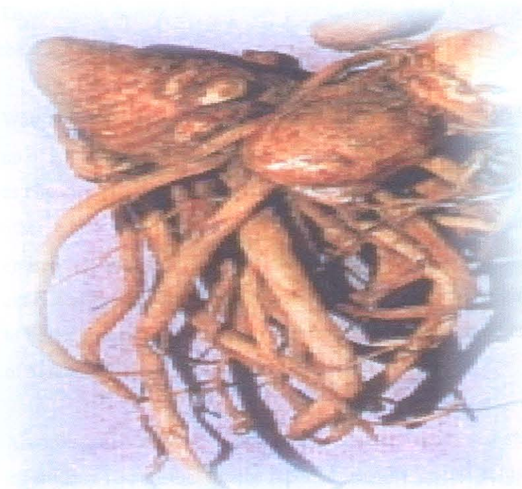
Fig. 2. Mature rhizomes of wild ginger (Van Wyk et al. , 1997)

Wild ginger is a perennial herb with tubers (Langenheim & Thimann, 1982). It is a deciduous plant with large, hairless leaves (Fig. 1) developing annually from small, distinctive, cone-shaped tubers (Van Wyk et al. , 2000). Langenheim & Thimann (1982) stated that the inflorescence can be a compact spike or an open raceme or the plant can bear solitary flowers, each flower or cluster of flowers joined by a conspicuous bract. The spectacular flower (Fig. 1) appear at ground level in early summer, from end of October to early December. They are broadly funnel-shaped, pink and white in colour with a small yellow blotch in the middle (Van Wyk et al. , 2000).