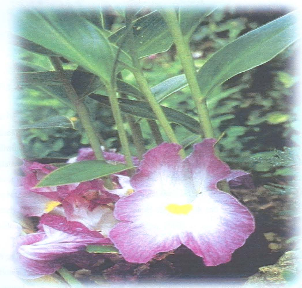
Fig. 1. Mature plant of wild ginger (Van Wyk, van Oudtshoorn & Gericke, 1997)

Siphonochilus aethiopicus , commonly known as wild ginger, is a member of the family Zingiberaceae and has a restricted distribution to South Africa, Zimbabwe, Malawi and Zambia. Wild ginger originated in north-eastern India. The plant (Fig. 1) is easily cultivated in the warm parts of South Africa and attempts have been made for the large scale production of rhizomes (Fig. 2) through tissue culture, in order to reduce the pressure on wild populations (Van Wyk, van Oudtshoorn & Gericke, 2000).