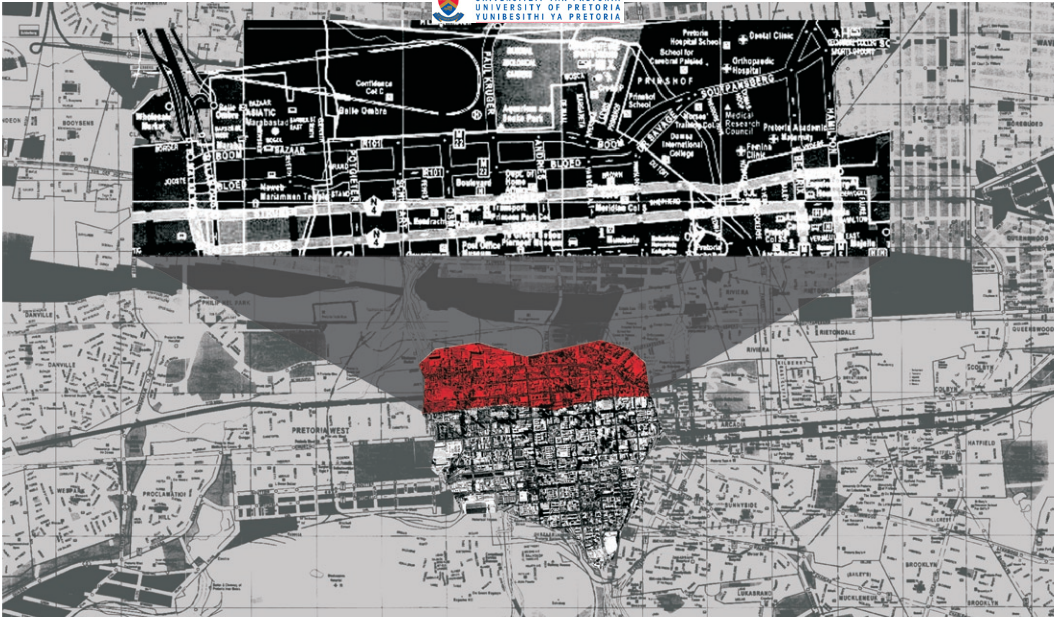
Fig 4.1: Precinct location