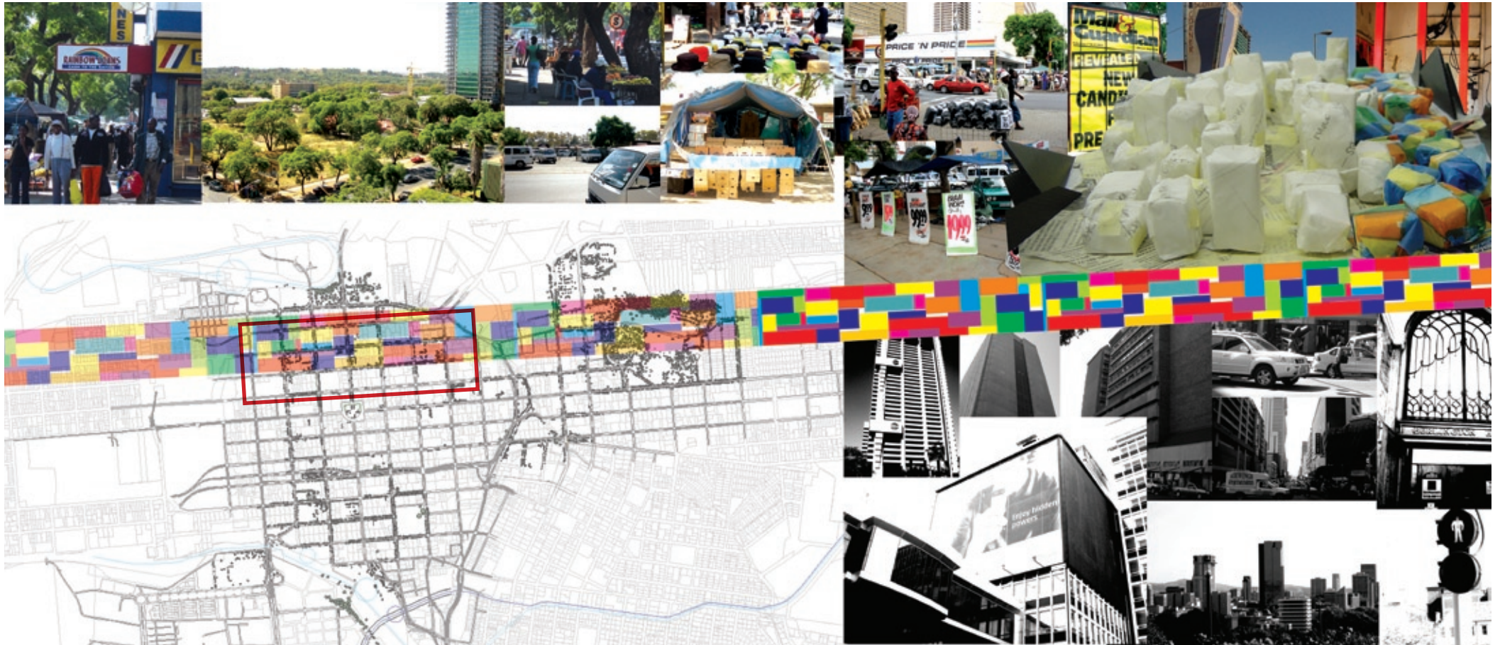
Fig 4.2: Precinct presentation