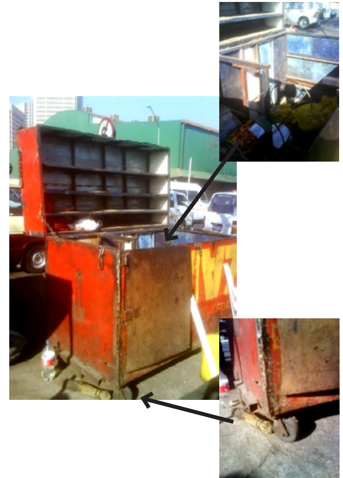
Fig 3.1: Existing mobile market unit on Bloed Street