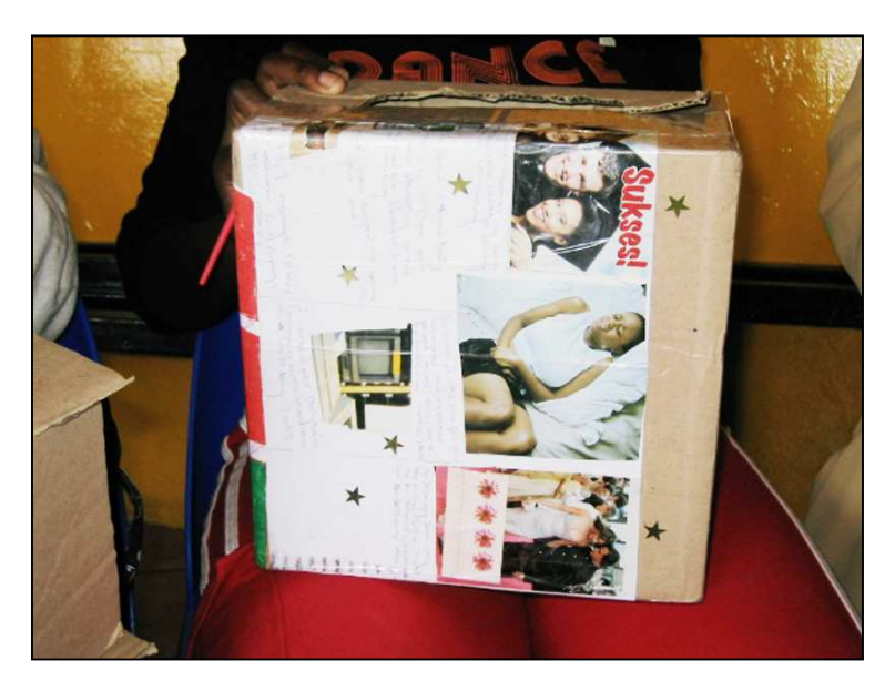
Figure 4.2 An example of a memory box made by a volunteer

P12- F8: 'So I thought the memory box is important that we must teach our clients, maybe our orphans that they must keep the memory box"